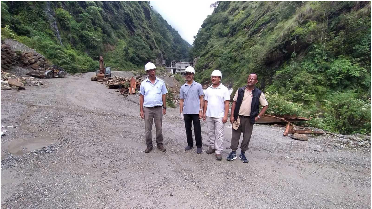
Figure 4: Site Visited by CEO, Vice President of BPC and CEO of NHL