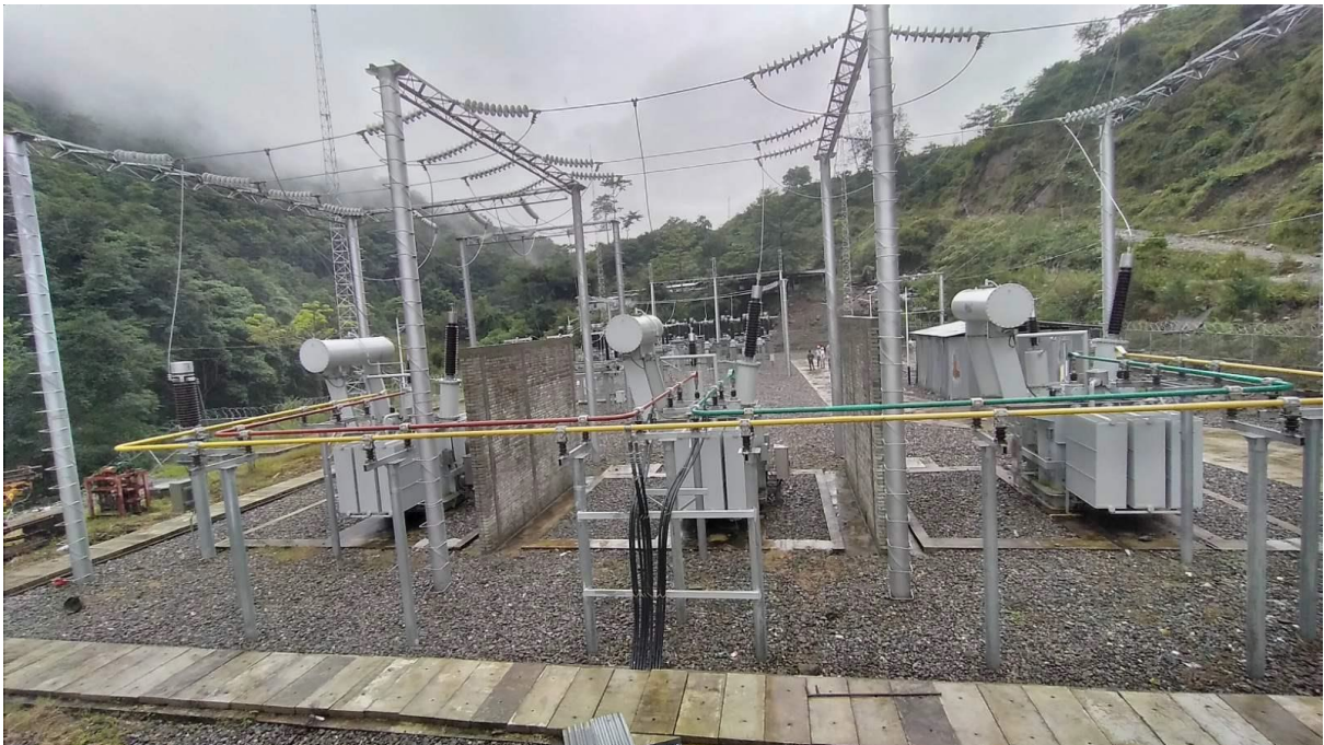
Figure 6: Switchyard Area after Completion of Electrical Works

Switch gear equipment has been completely installed in the month of May 2021, mean while internal wiring connection will be continued for upcoming two months.