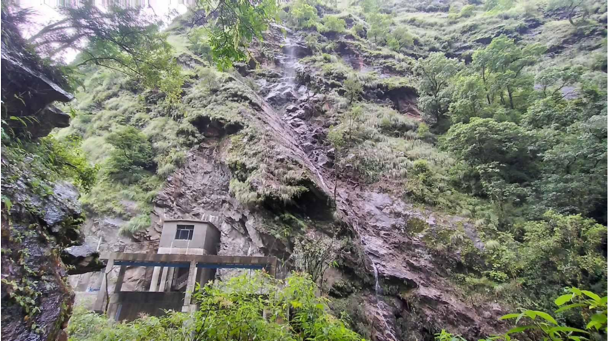
Figure 3: Intake Side View of Headworks

trashrack frame and stoplog frames has been completed. Construction for the access road up to level 1390.50 of intake at the right bank of headworks has been completed, shotcrete work for the slope protection of rock at both side of headworks has been completed, frame of the door and windows installation at the control room has been completed, masonry wall for the access road area has been completed.