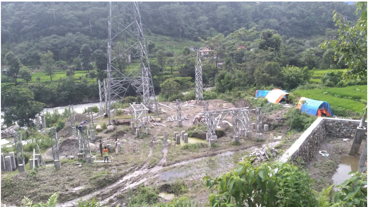
Figure 11: Gantry Erection Works at Transmission Line Switching Station