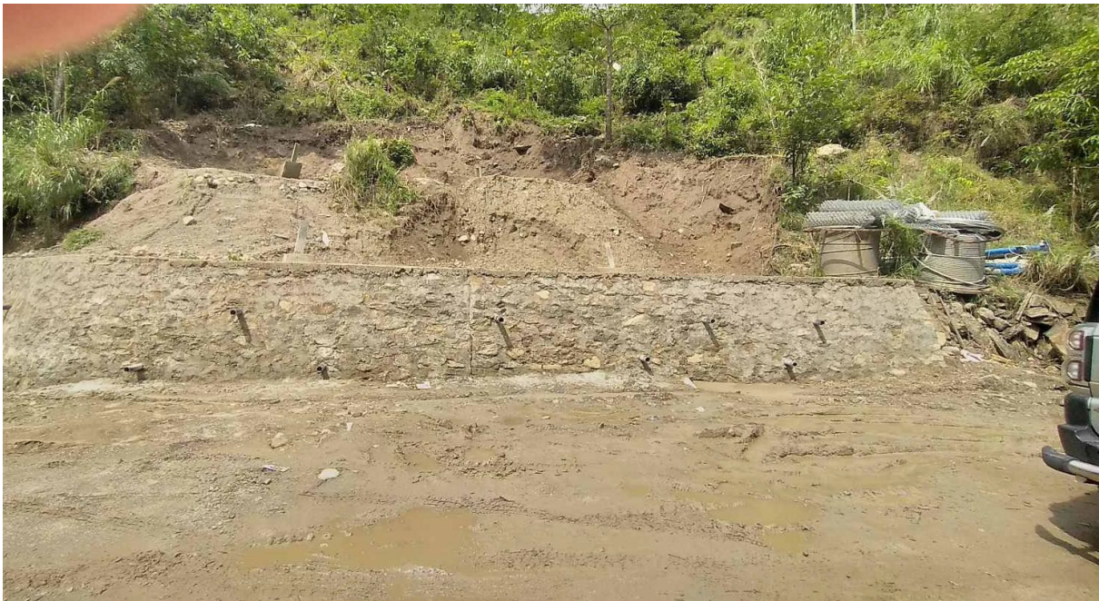
Figure 15: Foundation Protection Work at the Tower no. 1 of 132kV Transmission Line