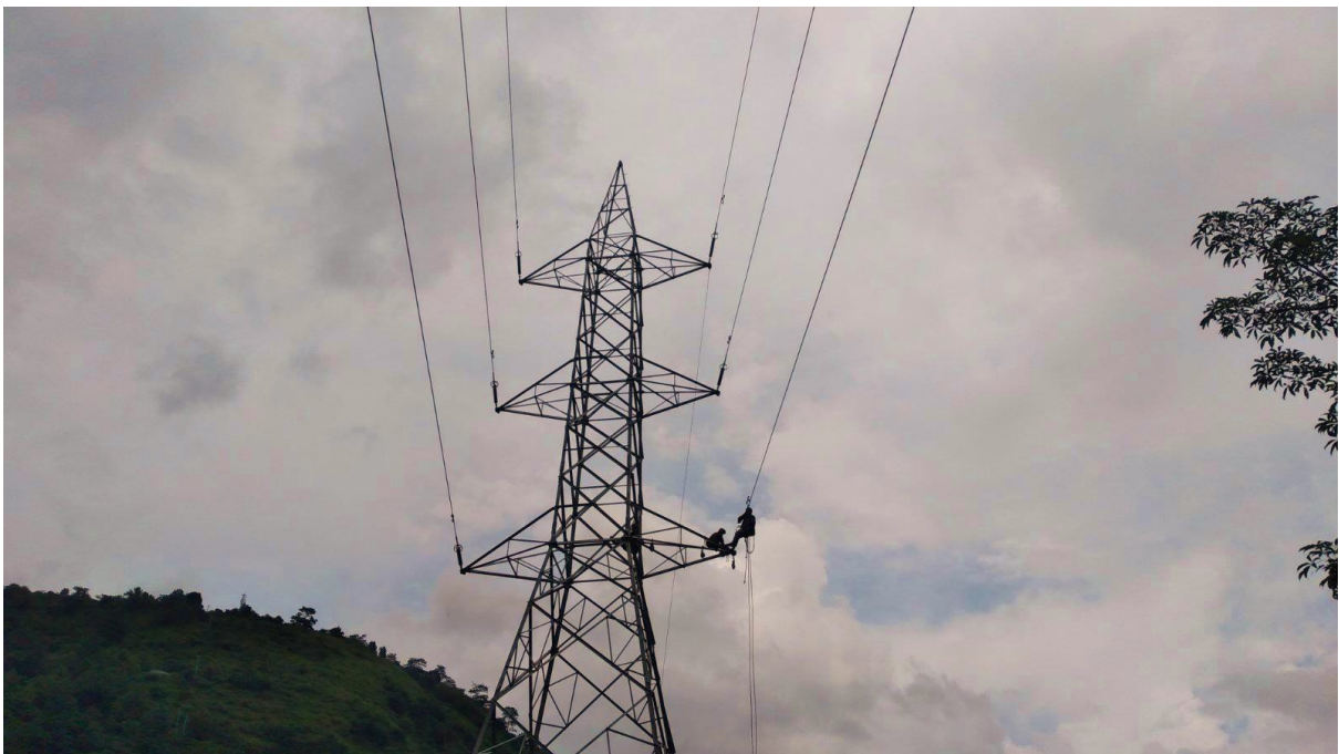
Figure 13: Conductor Stringing Work between the Tower no. 7 to 8