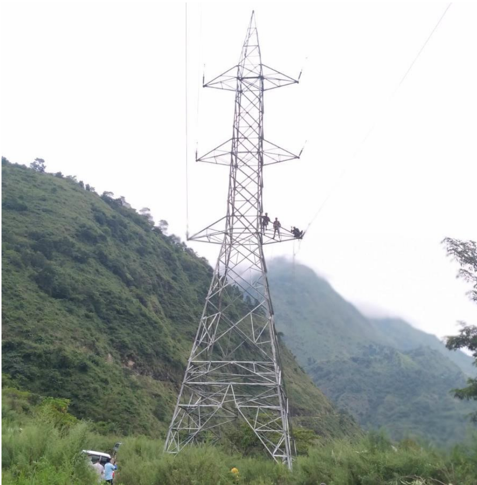
Figure 12: Conductor Stringing Work between the Tower no. 5 to 6