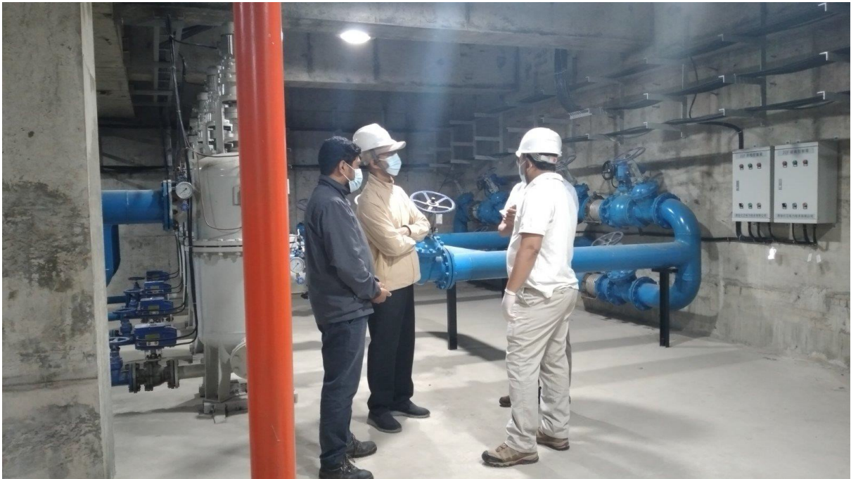
Figure 7: Powerhouse Site Visited by CEO, Vice President and Head of Operation of BPC