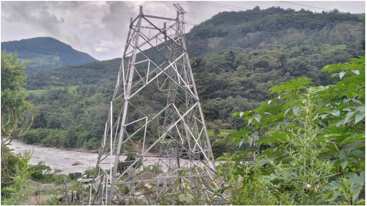
Figure 10: 132kV Transmission Line Tower Erection Work at Tower No. 25