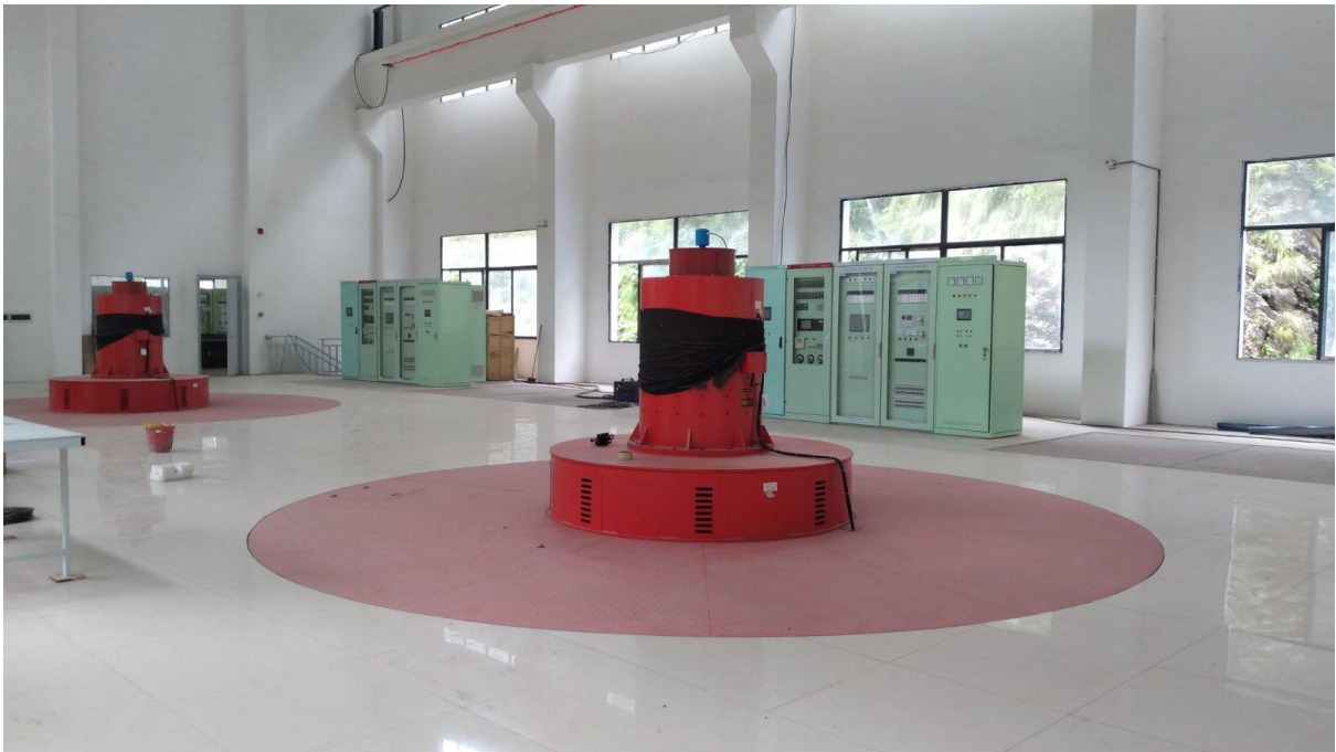
Figure 5: Machine Hall of the Powerhouse

completed. Steel Doors and windows frames installation has been completed. Glass installation on windows has been completed. Railing installation at staircase and cut out portion has been completed. Drainage at the periphery of powerhouse building has been completed. Plaster work at floor of main unit, control room and auxiliary powerhouse has been completed. Laying of tile on the floor of control room, main unit section has been started on the month June 2020 and the work is ongoing. Parqueting work and false ceiling work at the control room section of power house has been started from the month of July 2020. Temporary camp dismantles and surface leveling at powerhouse area has been completed. Structural concrete of tailrace has been completed. River protection works has been completed in the powerhouse area. Retaining wall about 153m has been completed. Stone soling work at the slope of retaining wall of powerhouse about 153m has been completed. Construction of the boundary wall and fencing work at the boundary on the periphery of the powerhouse and switchyard area is started in the month of September 2020 and the work is ongoing.