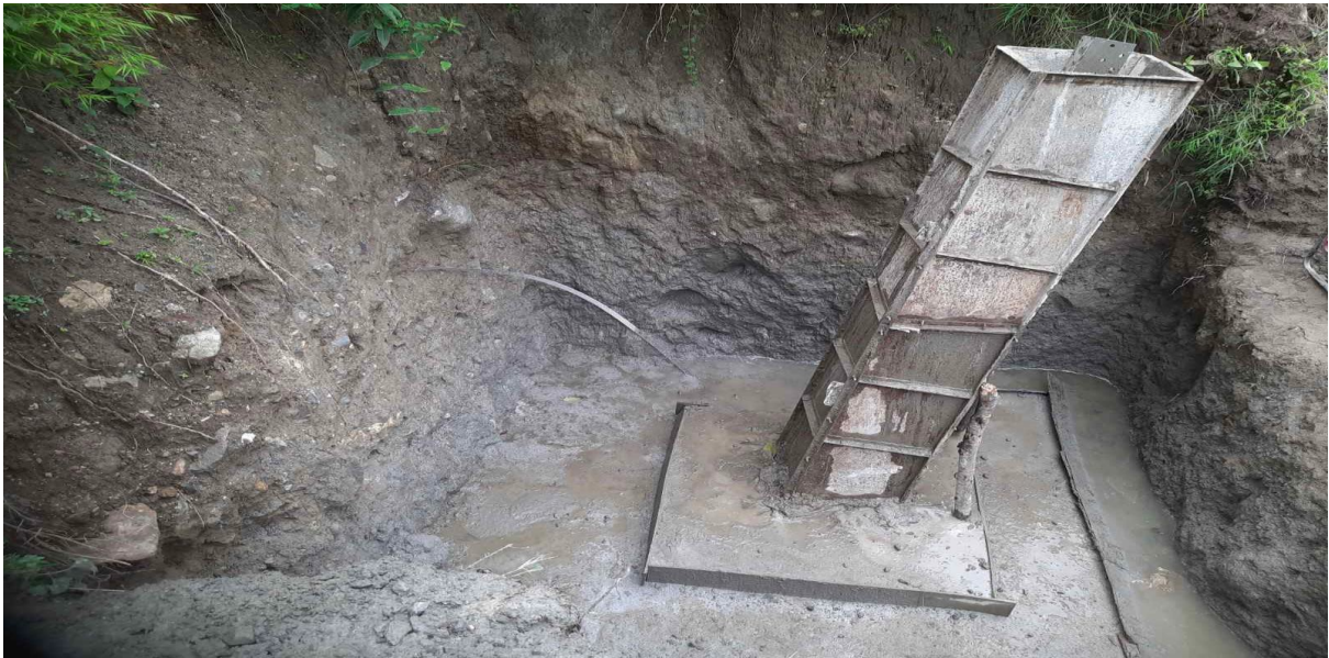
Figure 14: Concrete Work at the Foundation of Tower no. 1 of 132kV Transmission Line