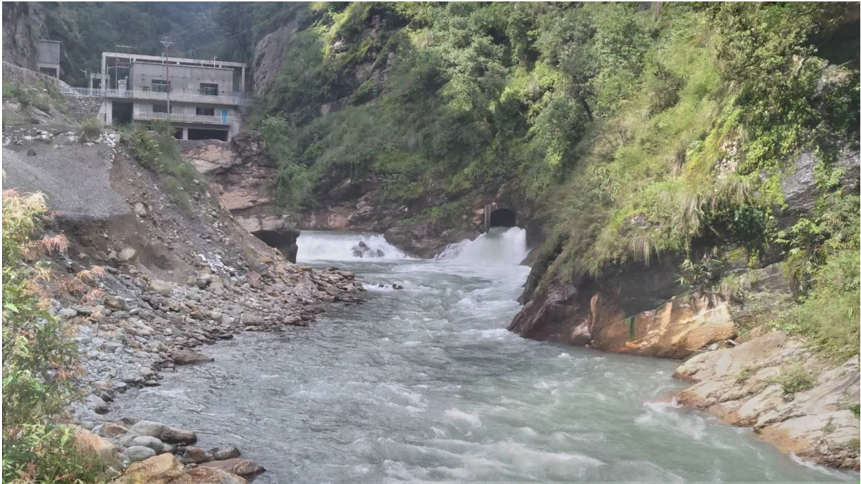
Figure 2: Outlet of Diversion Tunnel

The 300 m long diversion tunnel excavation has been finished. Concreting at Inlet and outlet part has been completed.