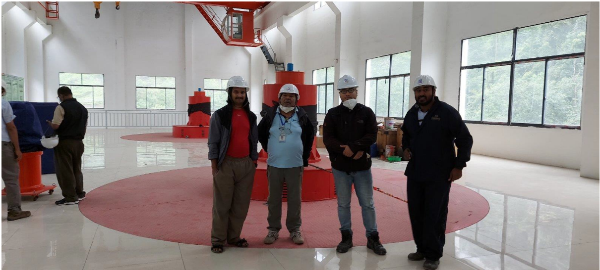
Figure 9: Site Visited by Sr. Consultant of HCEL at Powerhouse