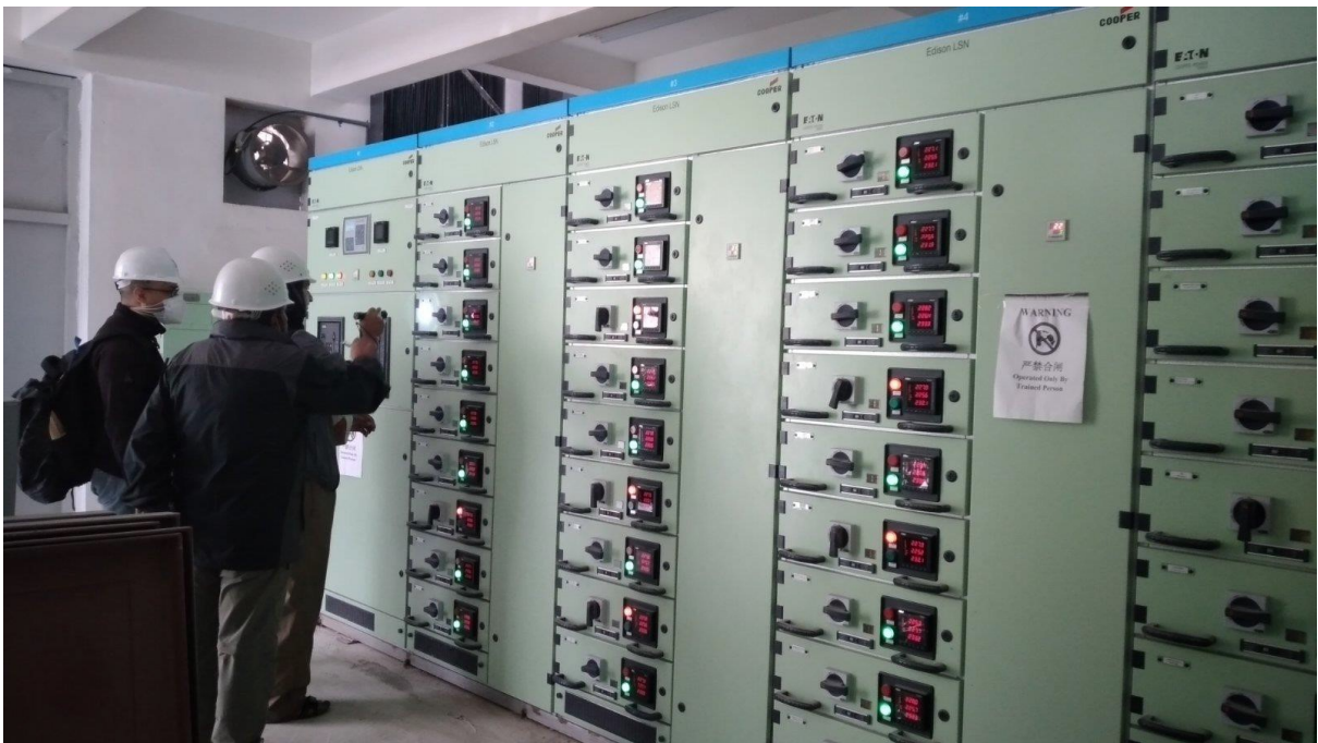
Figure 8: Control Room Cabinet