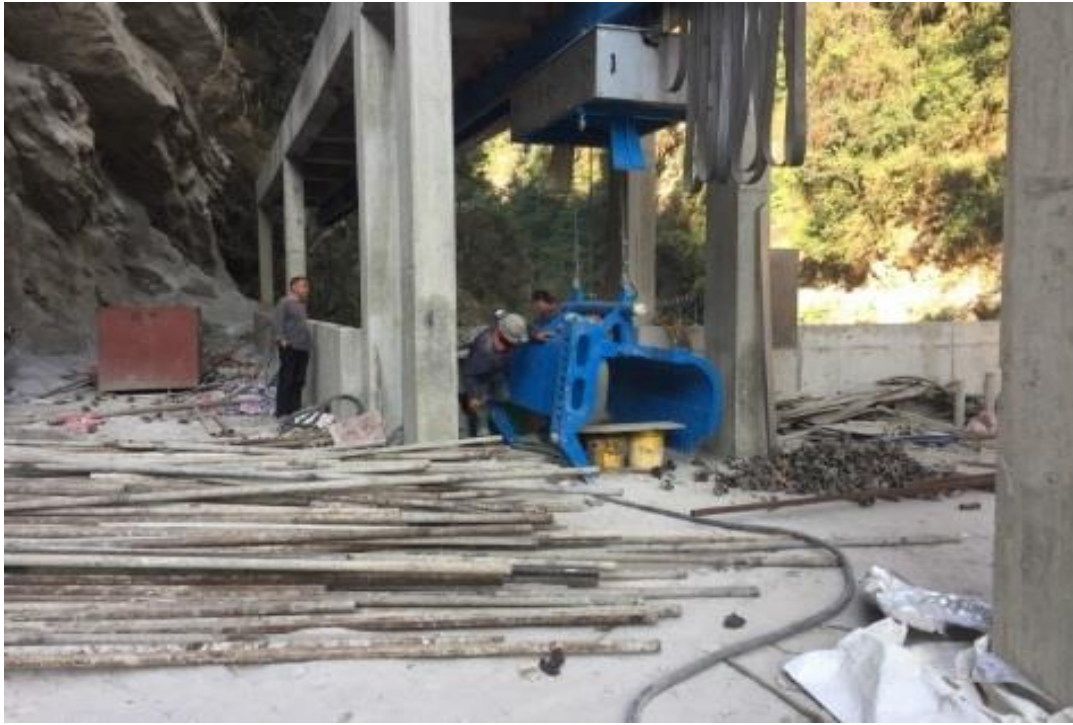
Figure 17: Installation of Trash Rack Cleaning Machine at Intake