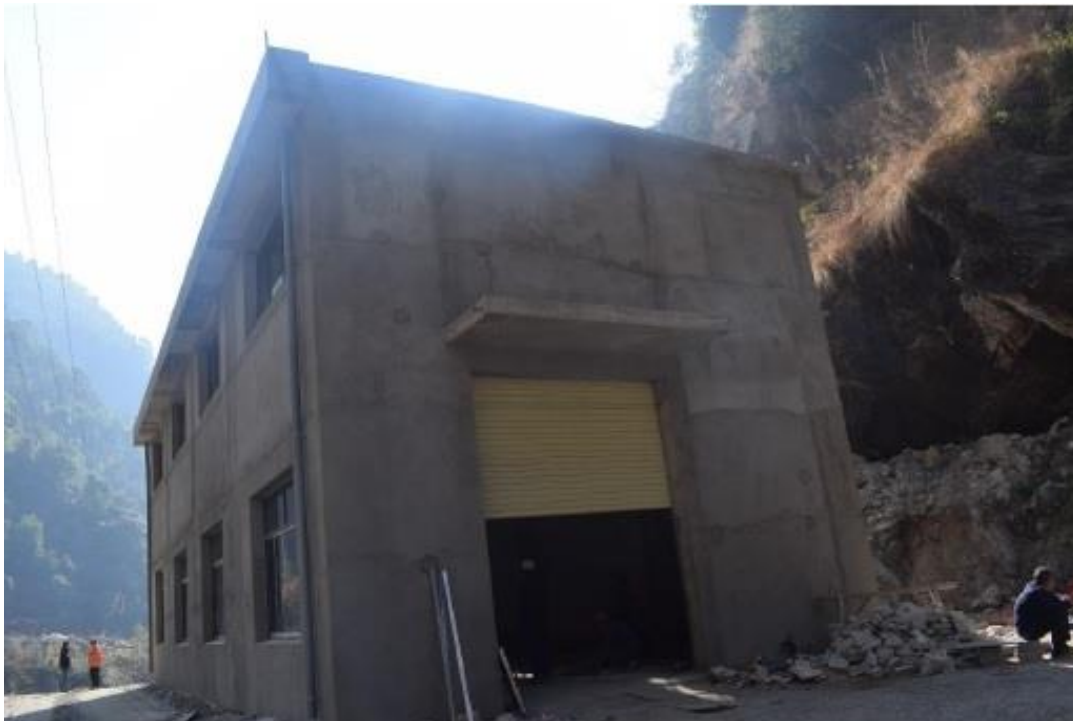
Figure 6: Shutter Installation at the entrance of Pump House of Siuri Diversion System