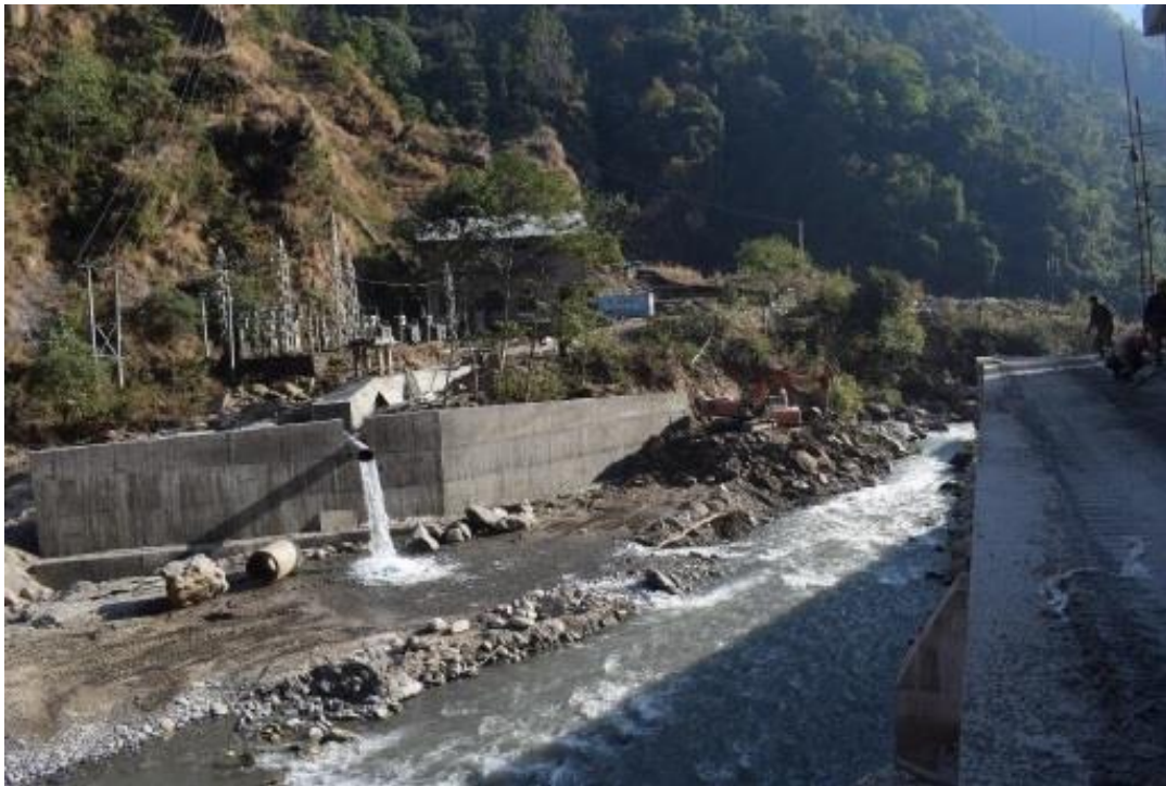
Figure 8: Construction of Retaining Wall for Siuri Diversion System