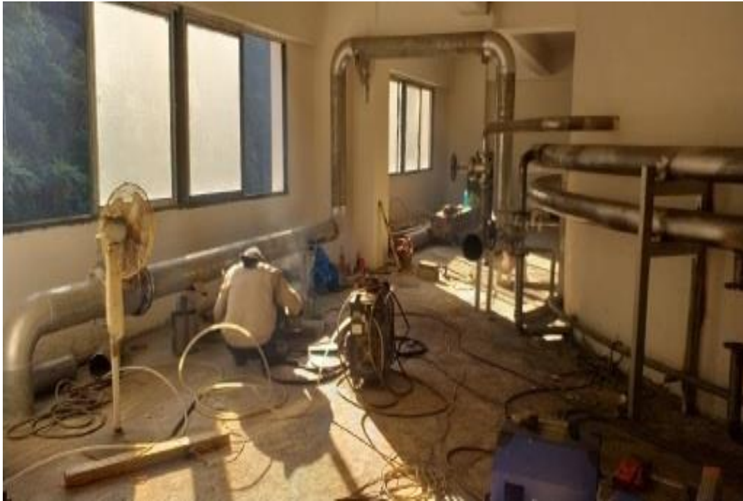
Figure 26: Air Cooler Pipe Connection at Unit 1 of Power House