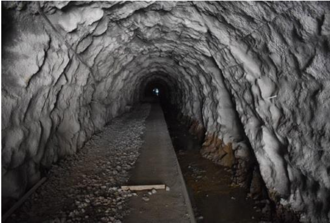
Figure 13: Construction of Flushing Canal at Adit 1