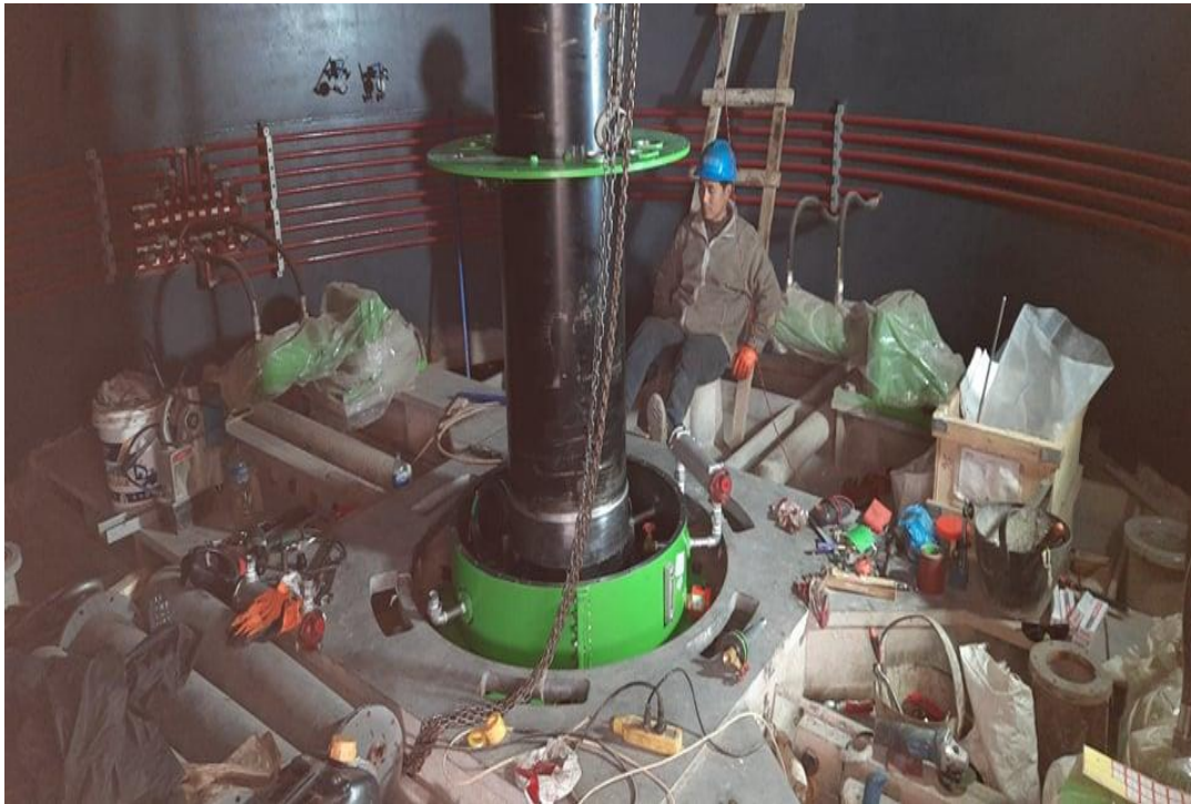
Figure 24: Collar Cover Installation at Main Shaft Unit 2 of Power House

3.1.10 Tower member components was shipped at the site for 13. Nos of towers on the month of October.