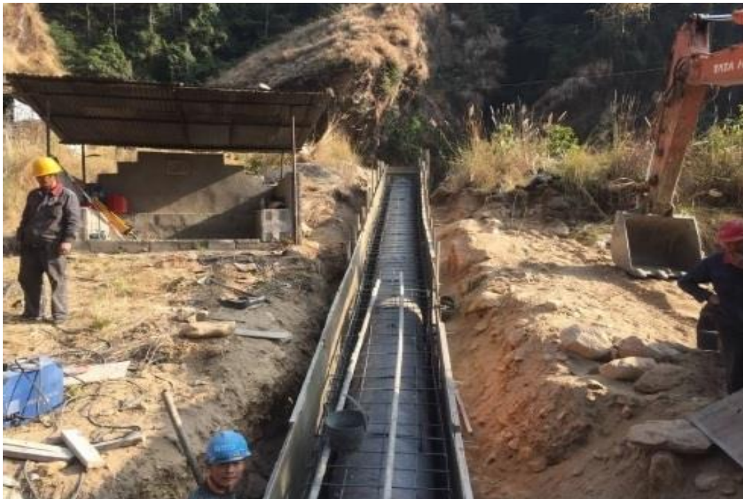
Figure 20: Installation of Penstock in Between Siuri Dam and Siuri Tailrace