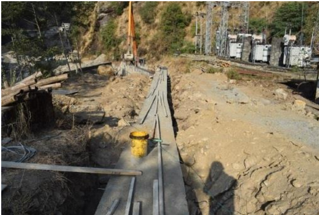
Figure 10: Concrete Casing at the Penstock Pipe of Siuri Diversion System