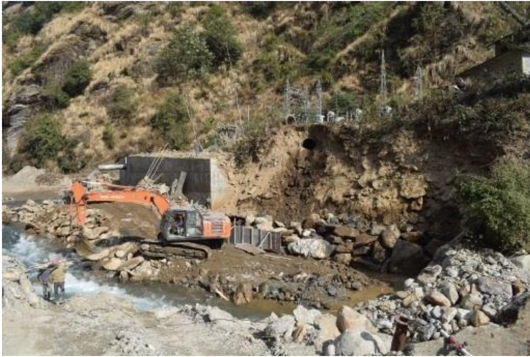
Figure 7: Construction of Retaining Wall for Siuri Diversion System