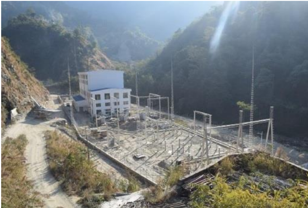
Figure 15: Outlook of Switchyard Area

corrected on the same month. Final welding of steel tubular poles for switch gear equipment has been progressed for both the incoming and outgoing feeder in the month of December 2020.