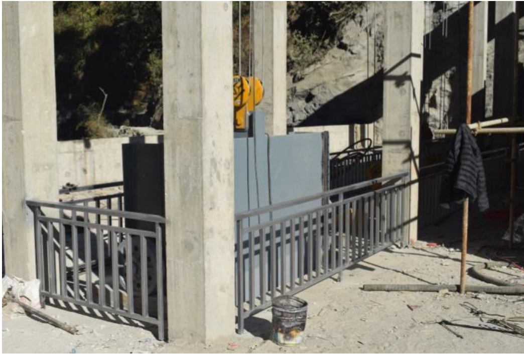
Figure 3: Railing Installation at the Periphery of the Stoplogs