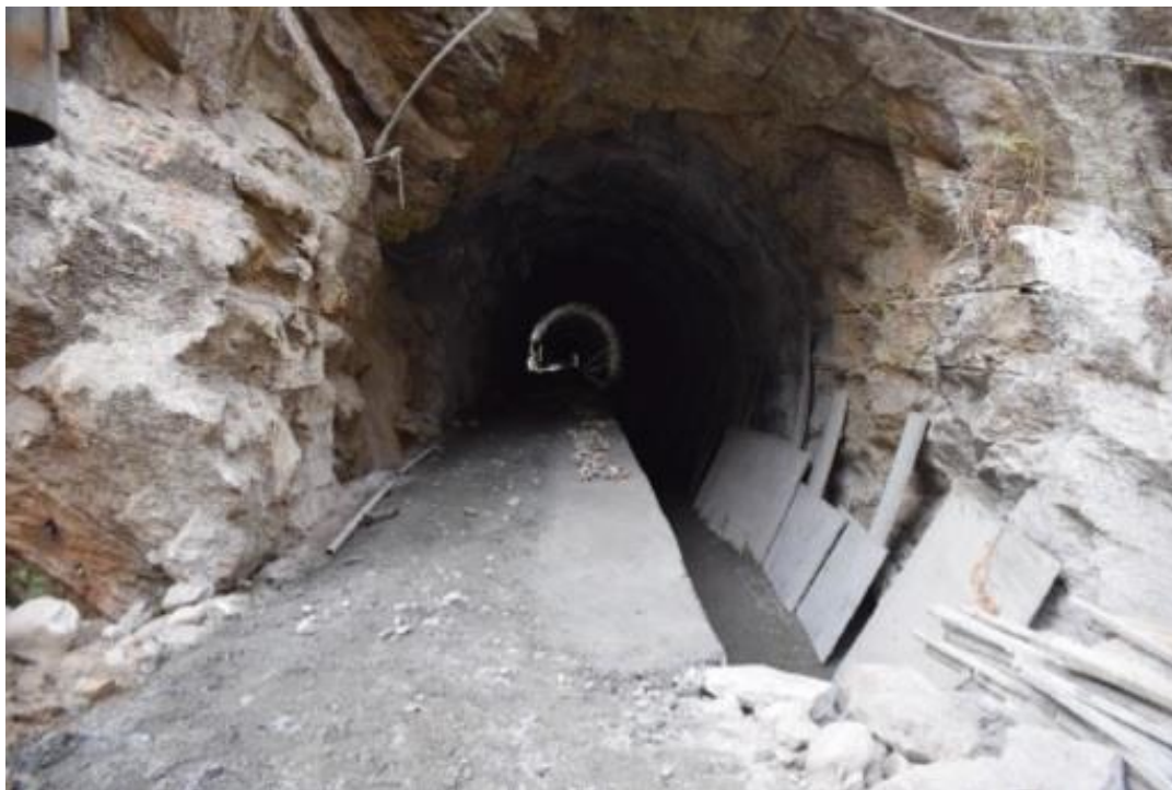
Figure 12: Construction of Flushing Canal at Adit 1