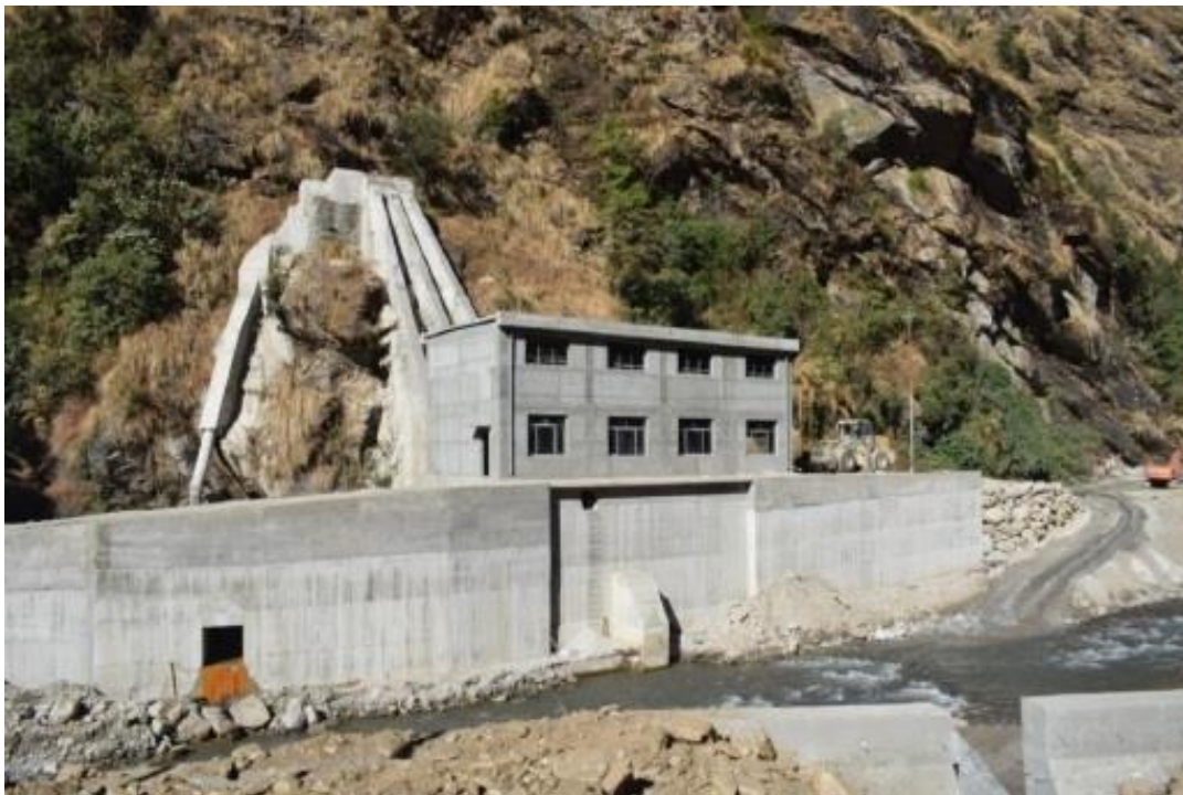
Figure 4: Plaster Work at the Pump House of Siuri Diversion System

Excavation of Siuri pumping outlet pool has been completed. Construction of outlet pool for storage of 1.1 m 3 /s discharge has been completed. Installation of three numbers of inlet pipe (40 cm diameter) and 70 cm diameter outlet pipe at overhead tank has been completed. Construction of the retaining wall and pump house up to level 1379.00masl has been completed. Brickwork at the pump house has been completed, windows and door steel frame installation has been completed, glass installation at the windows are ongoing, Plum concrete (C20) work for the retaining wall at the left bank of Nyadi river near the Siuri diversion pump house is ongoing. Inlet penstock pipe installation and construction of weir is ongoing, plaster work at the pump house is ongoing.