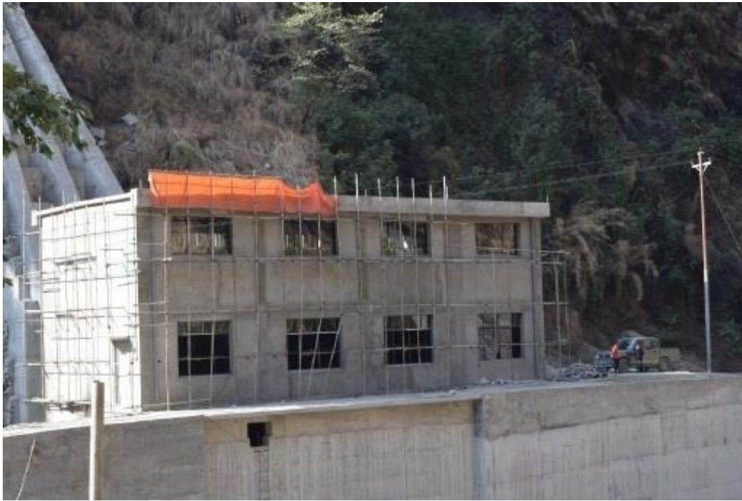
Figure 5: Glass Installation on the Windows at the Pump House of Siuri Diversion System