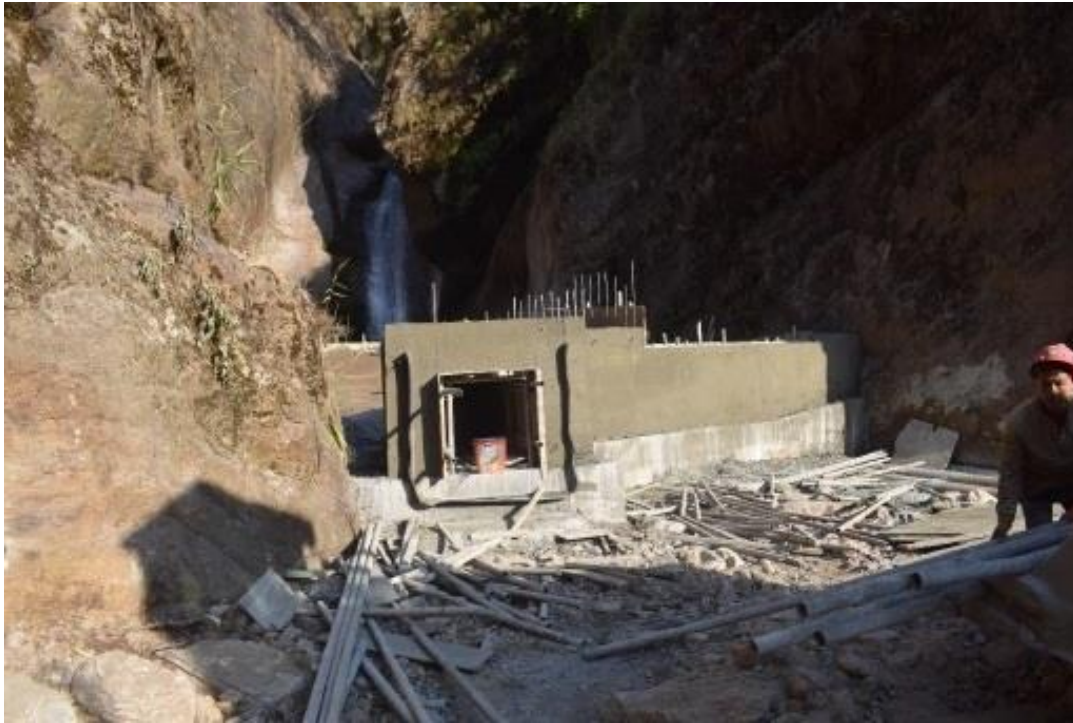
Figure 9: Concrete Work at the Weir of Siuri Diversion System