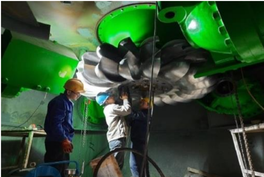
Figure 25: Runner Installation at Unit 2 of Power House