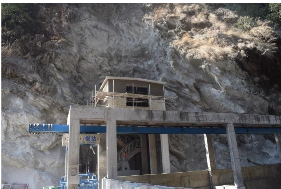
Figure 2: Plaster Work at the Control Room of Intake