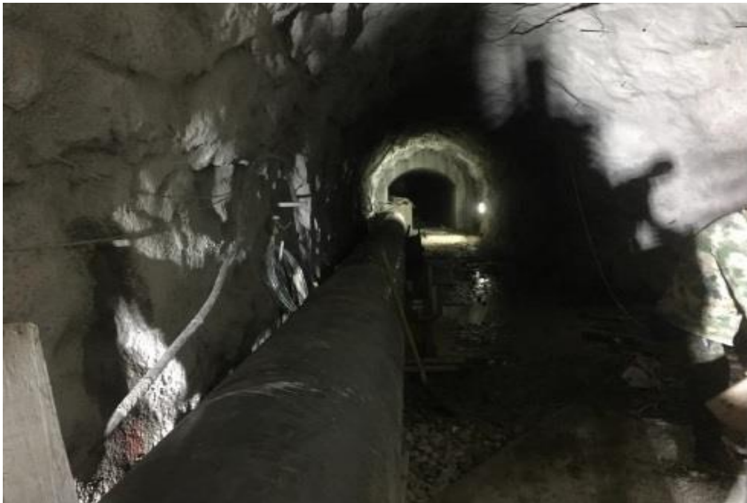
Figure 22: Installation of Siuri Penstock Pipe at Adit 1