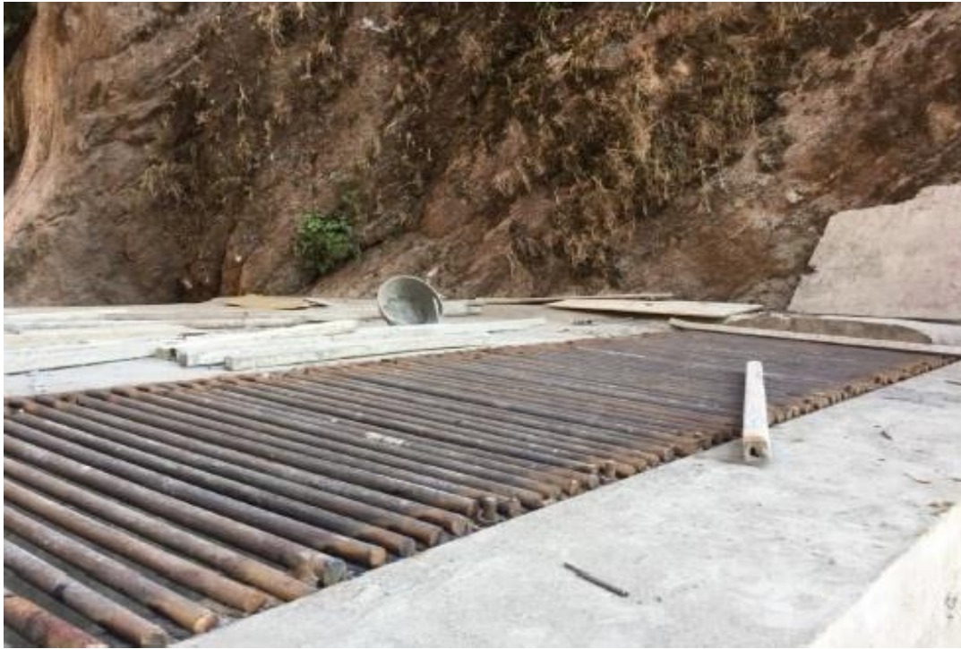
Figure 21: Installation of Bottom Stockade at Siuri Dam