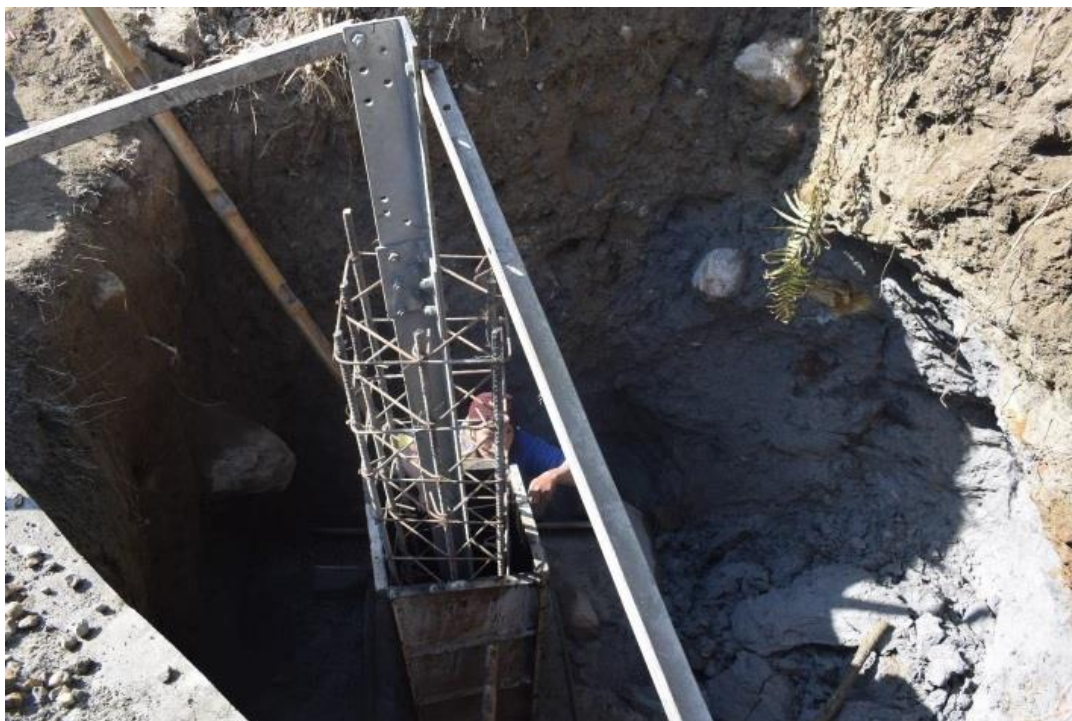
Figure 27: Reinforcement Works at Stub of Tower No. 15