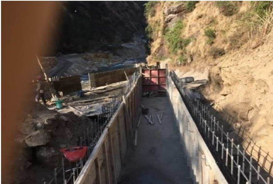
Figure 18: Installation of Siuri Diversion Gate at (1200x1200) at Siuri Box Culvert