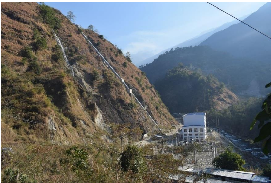
Figure 14: Outlook of Power House

level at Assembly bay 1066.715 m and at Control room up to level 1058.345 m has been completed. Roofing of powerhouse about 90% work has been completed. Brick work for housing construction has been completed. Plaster work at outside and inner side of powerhouse has been completed. Painting work has been completed. Steel Doors and windows frames installation has been completed. Glass installation on windows has been completed. Railing installation at staircase and cut out portion has been completed. Drainage at the periphery of powerhouse building has been completed. Plaster work at floor of main unit, control room and auxiliary powerhouse has been completed. Laying of tiles on the floor of control room, main unit section has been started on the month June. Parqueting work and false ceiling work at the control room section of power house has been started from the month of July. Temporary camp dismantles and surface leveling at powerhouse area has been completed. Structural concrete of tailrace has been completed. River protection works has been completed in the powerhouse area. Retaining wall about 153m has been completed. Stone soling work at the slope of retaining wall of powerhouse about 153m has been completed. Construction of the boundary wall and fencing work at the boundary on the periphery of the powerhouse and switchyard area is started on the month of September 2020 and the work is ongoing.