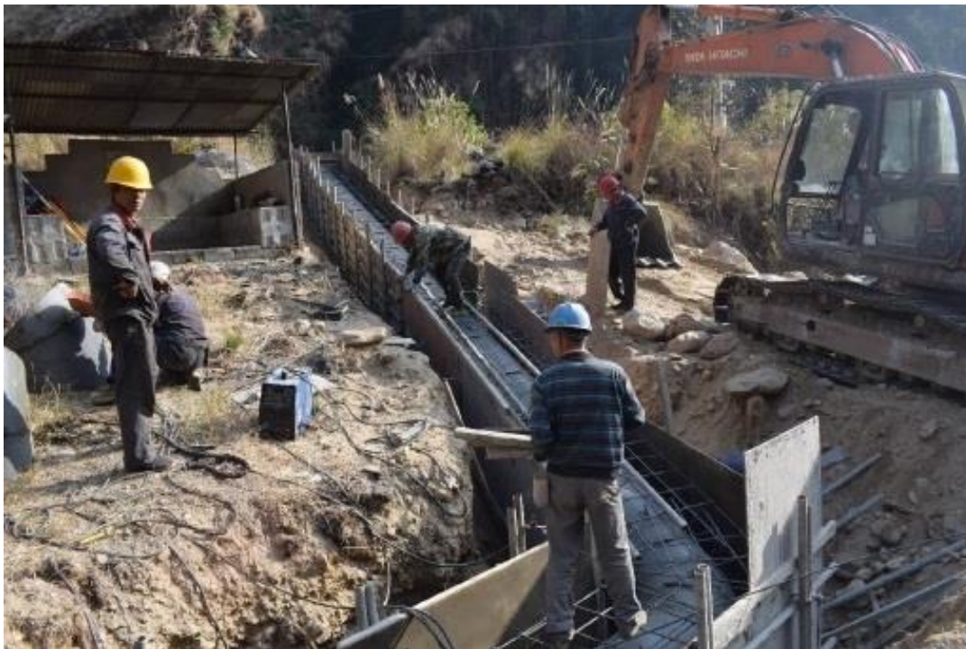
Figure 11: Reinforcement Work at the Penstock Pipe of Siuri Diversion System