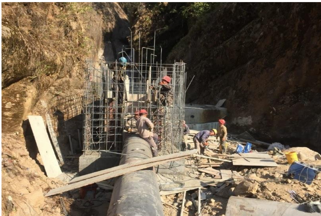
Figure 23: Pipe and Other Embedded Parts of Gate Being Installed