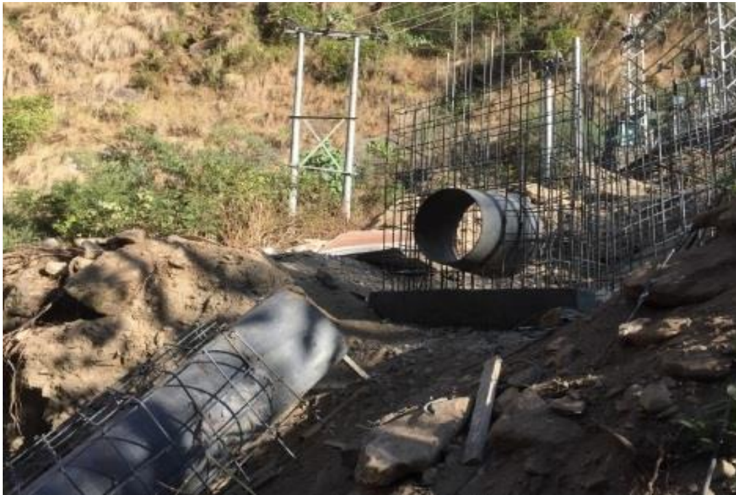
Figure 19: Installation of Reducer Downstream from Siuri Box Culvert