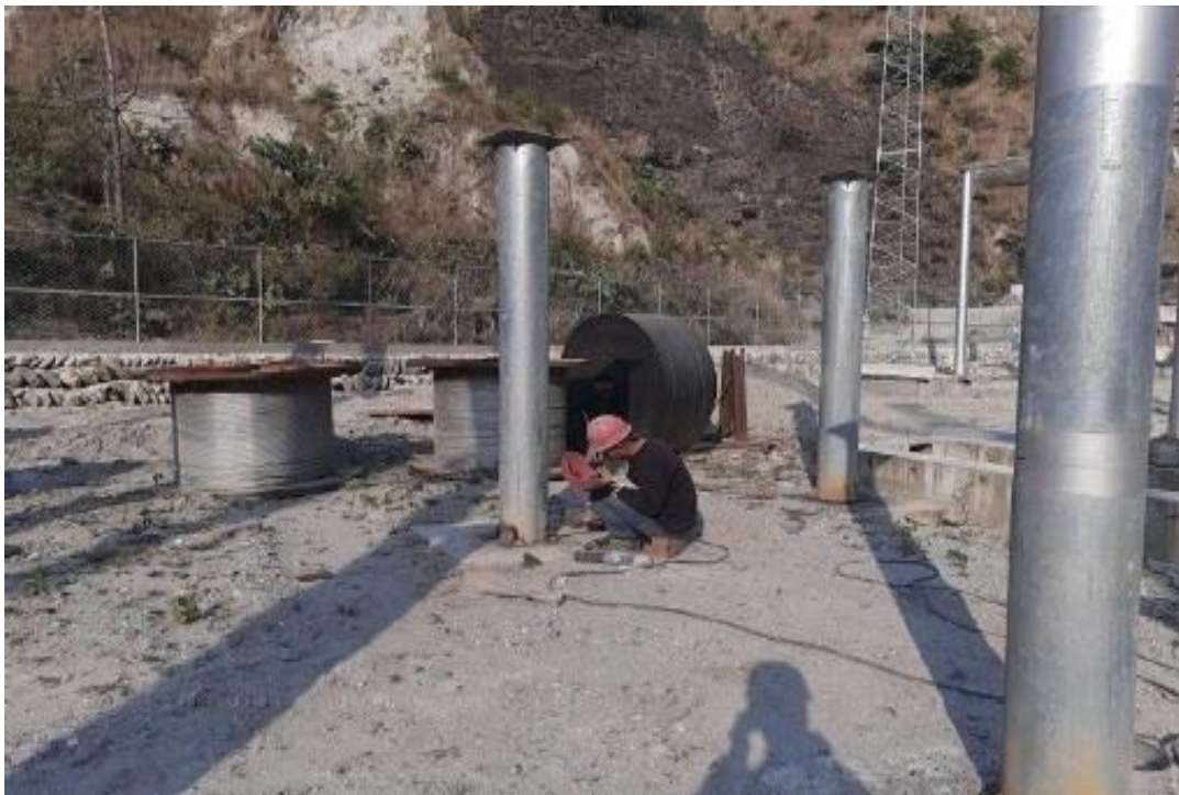
Figure 16: Installation of CT/PT Pole at Switchyard