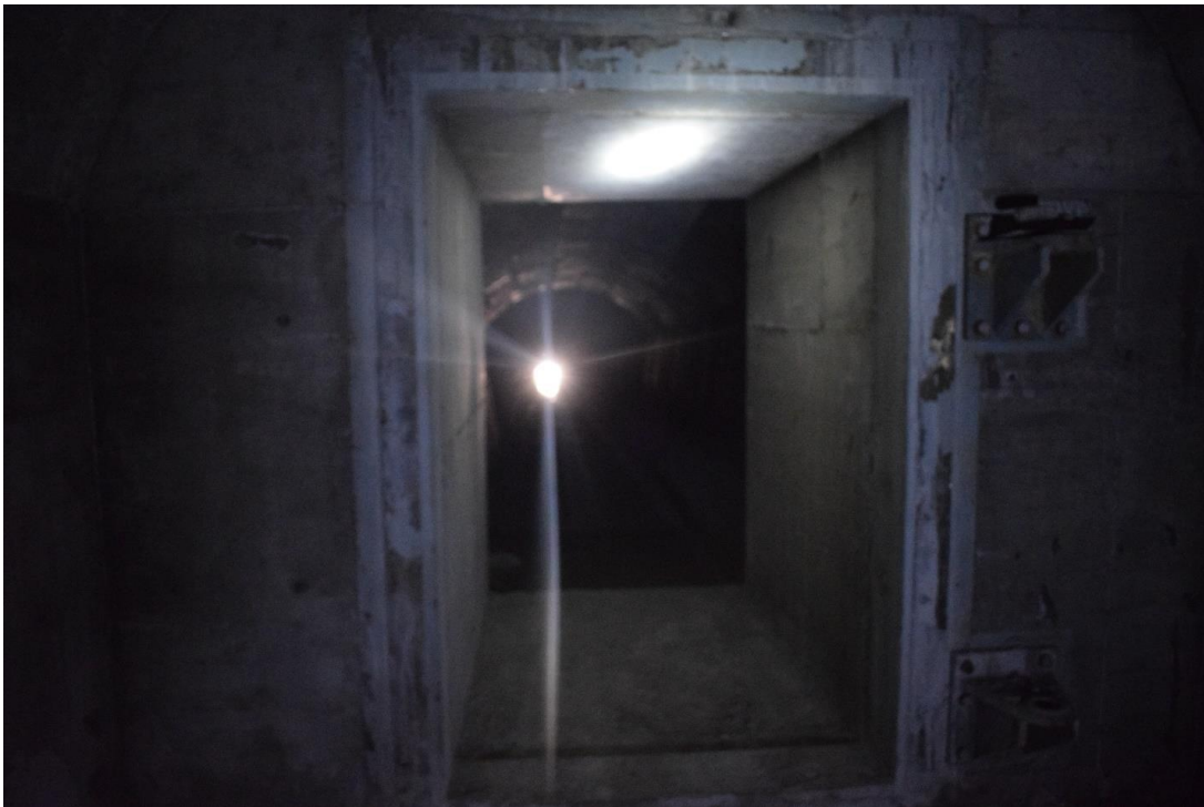
Figure 19: Bulkhead Gate Frame Installation at Adit 2