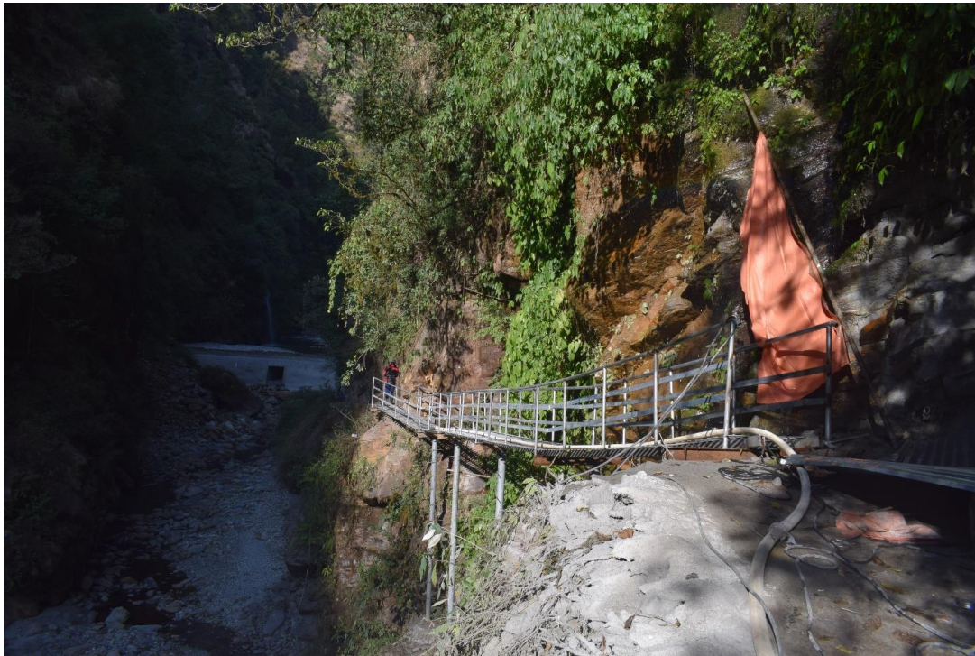
Figure 4: Construction of the Access Road from Headworks to Distributary Structure