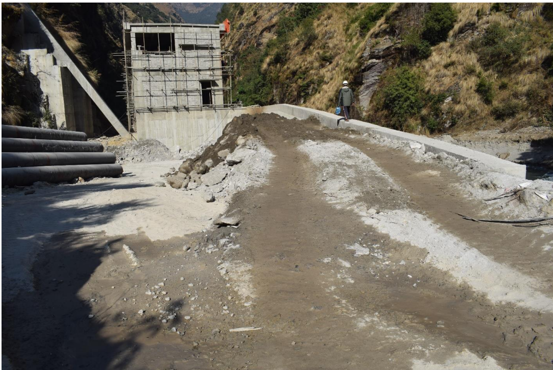
Figure 7: Backfilling Work at the Pump House of Siuri Diversion System