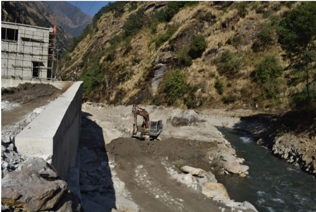
Figure 8: Excavation for the Siuri Diversion Inlet Pipe Installation