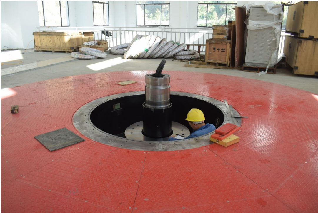
Figure 23: Thrust/Guide Bearing Installation Preparation of Unit#2