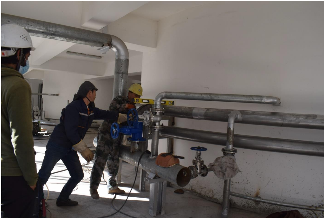
Figure 25: Technical Water Pipe System and Valve Installation for Unit#2