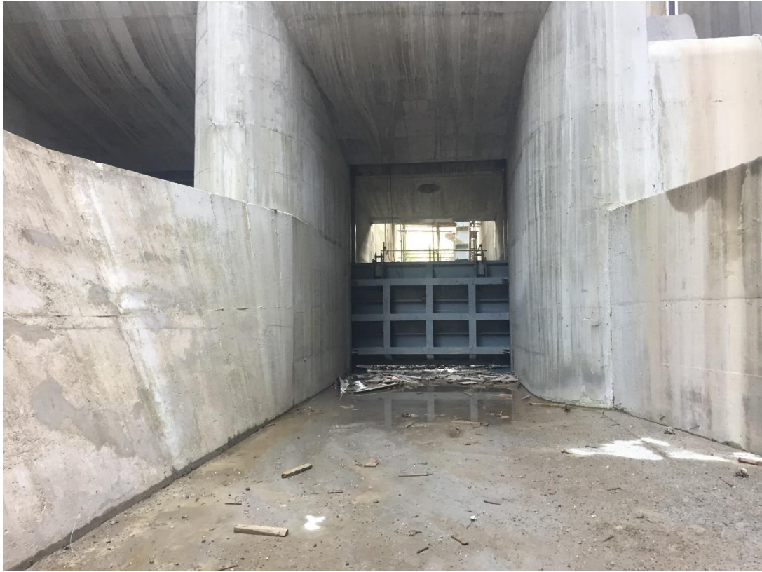
Figure 20: Installation of Stoplogs