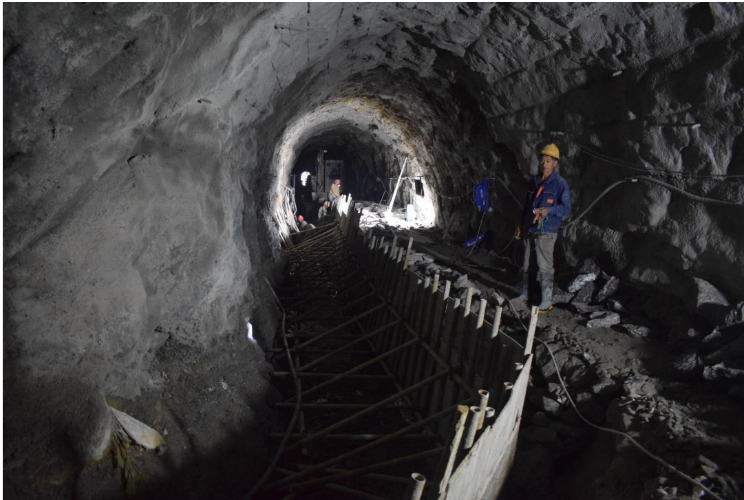
Figure 12: Construction of the Box Culvert for Flushing at Flushing Tunnel