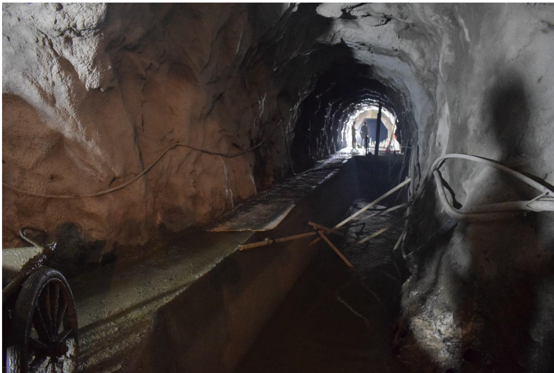
Figure 11: Construction of the Box Culvert for Flushing at Flushing Tunnel