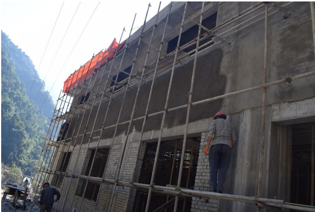
Figure 9: Plaster Work at the Pump House of Siuri Diversion System