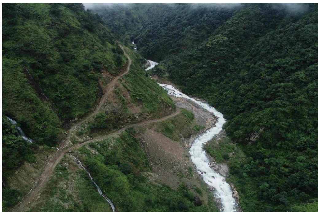
Figure 14: Access Road to Headworks near Naiche Village