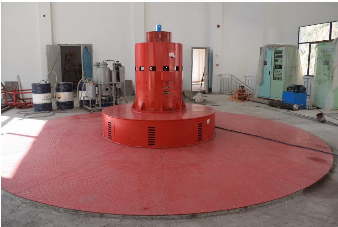
Figure 24: Installation of Exciter at Unit #1