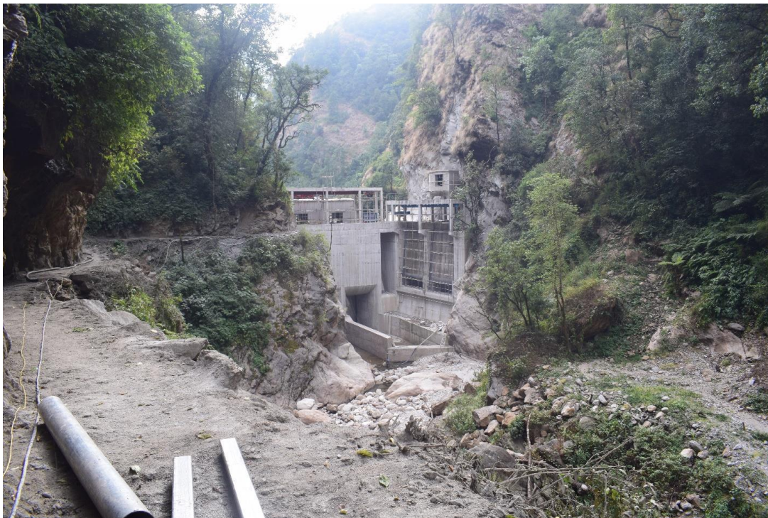
Figure 3: Construction of the Access Road from Headworks to Distributary Structure