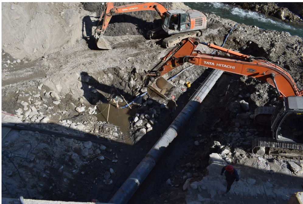
Figure 16: Installation of the Inlet Pipe of Siuri Diversioni at the Invert of River