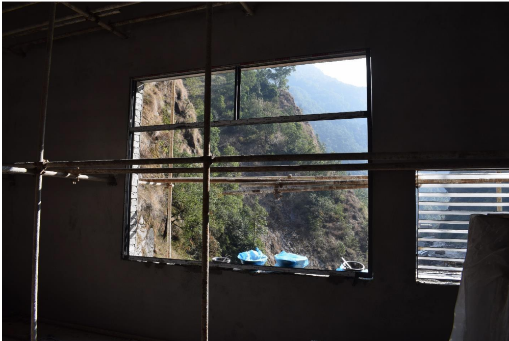
Figure 2: Installation of the Frame of Windows at Control Room of Headworks