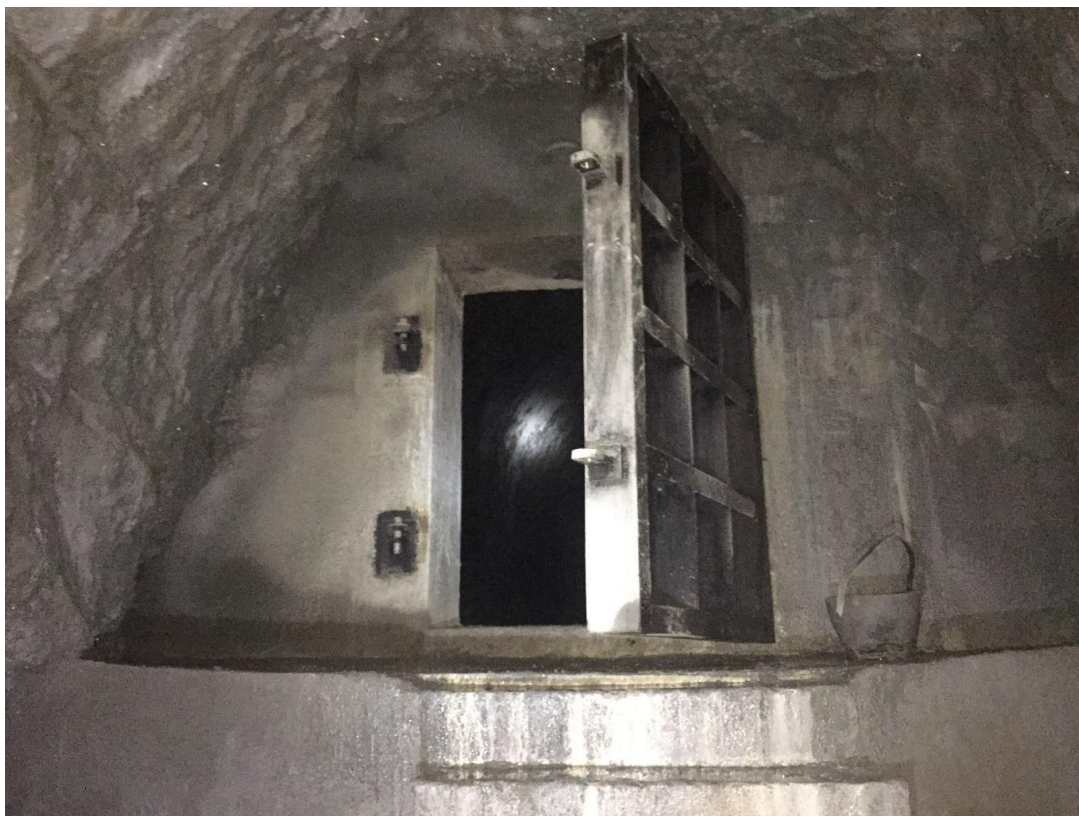
Figure 22: Installation of Sand Break Steel Door at Settling Basin