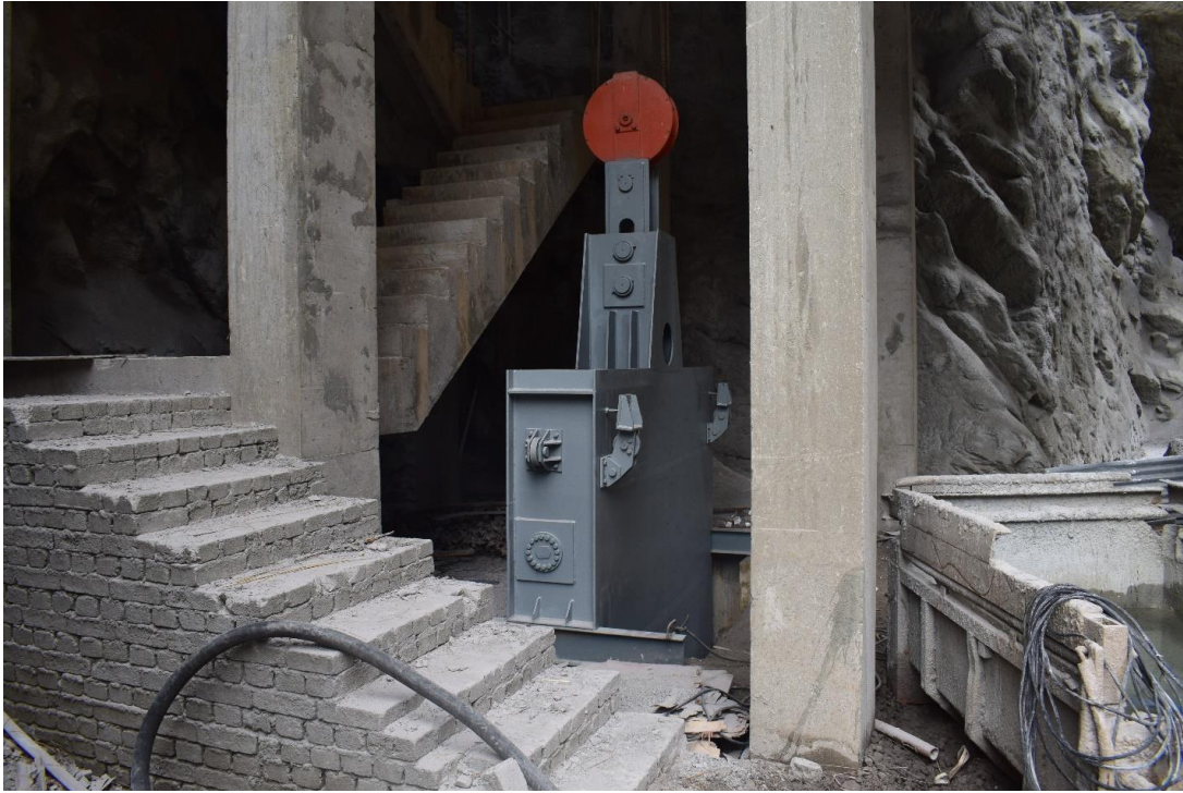
Figure 18: Installation of Intake Gate