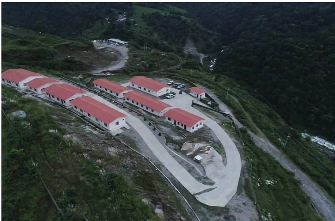
Figure 15: Permanent Housing Camp of Employers and Employer's Representative