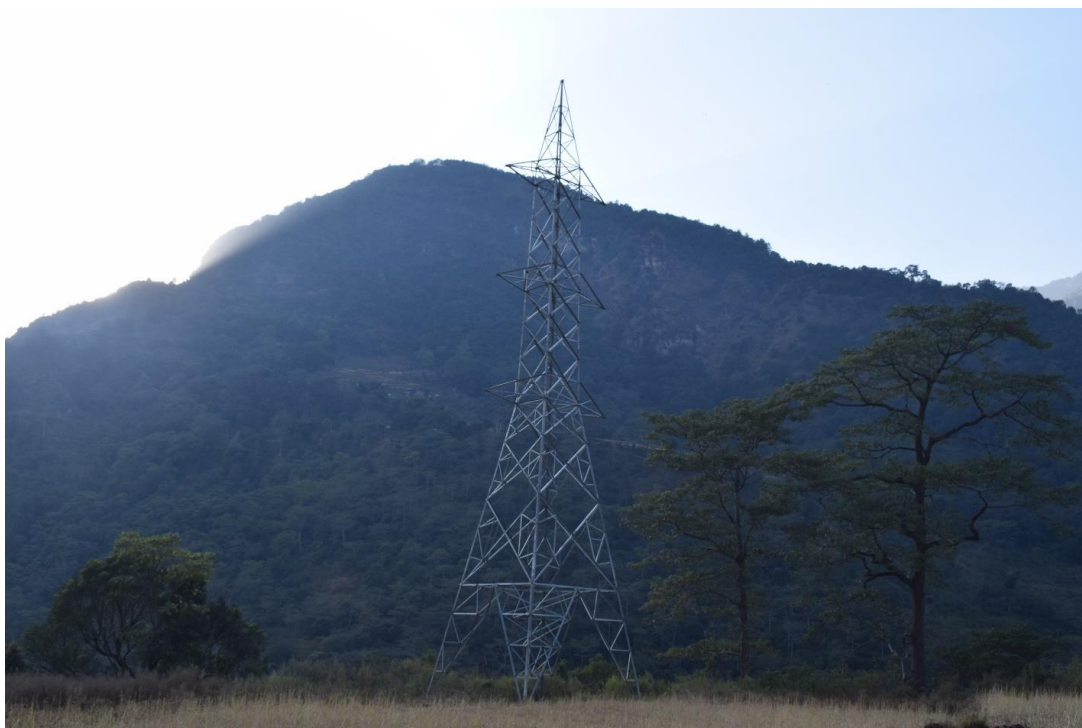
Figure 26: Transmission Line Tower Erection Works of Tower No. 6