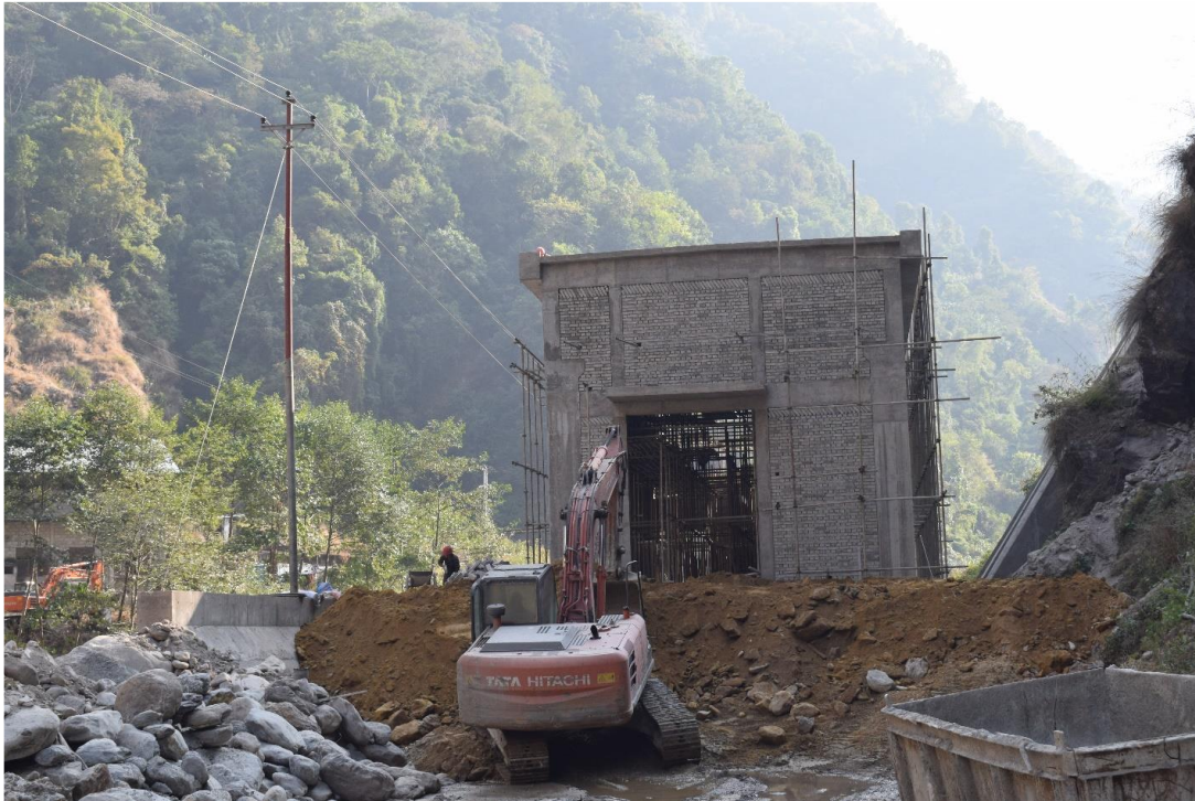
Figure 6: Backfilling Work at the Pump House of Siuri Diversion System