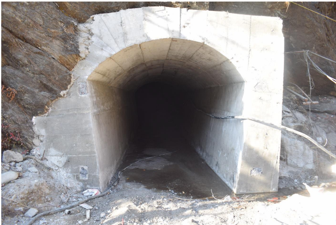
Figure 13: Outlet Portal of the Adit 2