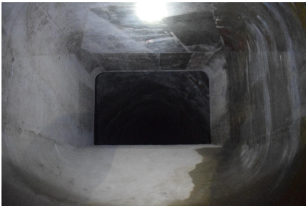
Figure 10: Transition Section of Settling Basin to HRT

flushing tunnel from Settling Basin to valve of flushing pipe has been completed. Box culvert (size 1.5m*2.0m*27m) for the flushing tunnel at the outside of adit I has been completed.