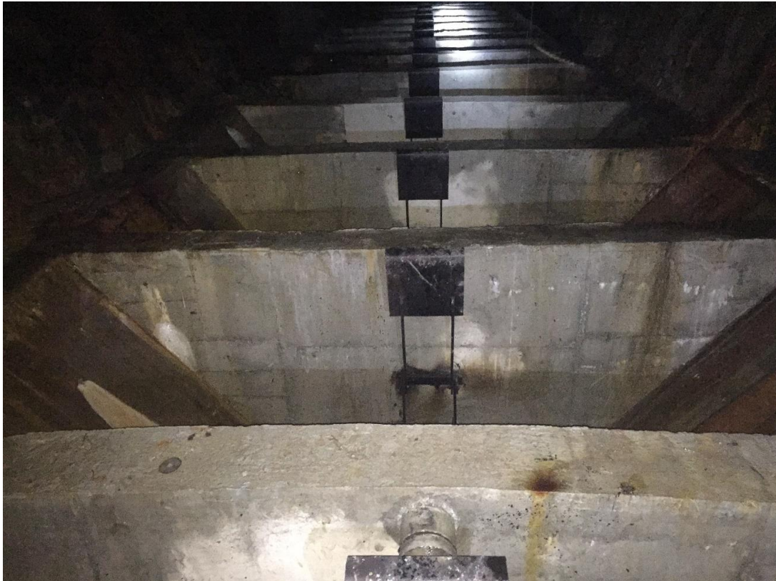
Figure 21: Installation of Settling Basin Disturbance Mechanism