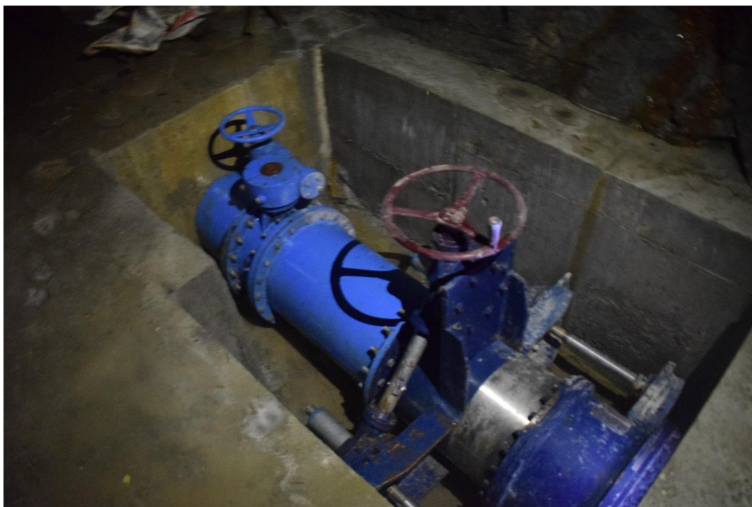
Figure 17: Conical Valve and Sluice Valve of Flushing Pipe at the Flushing Tunnel