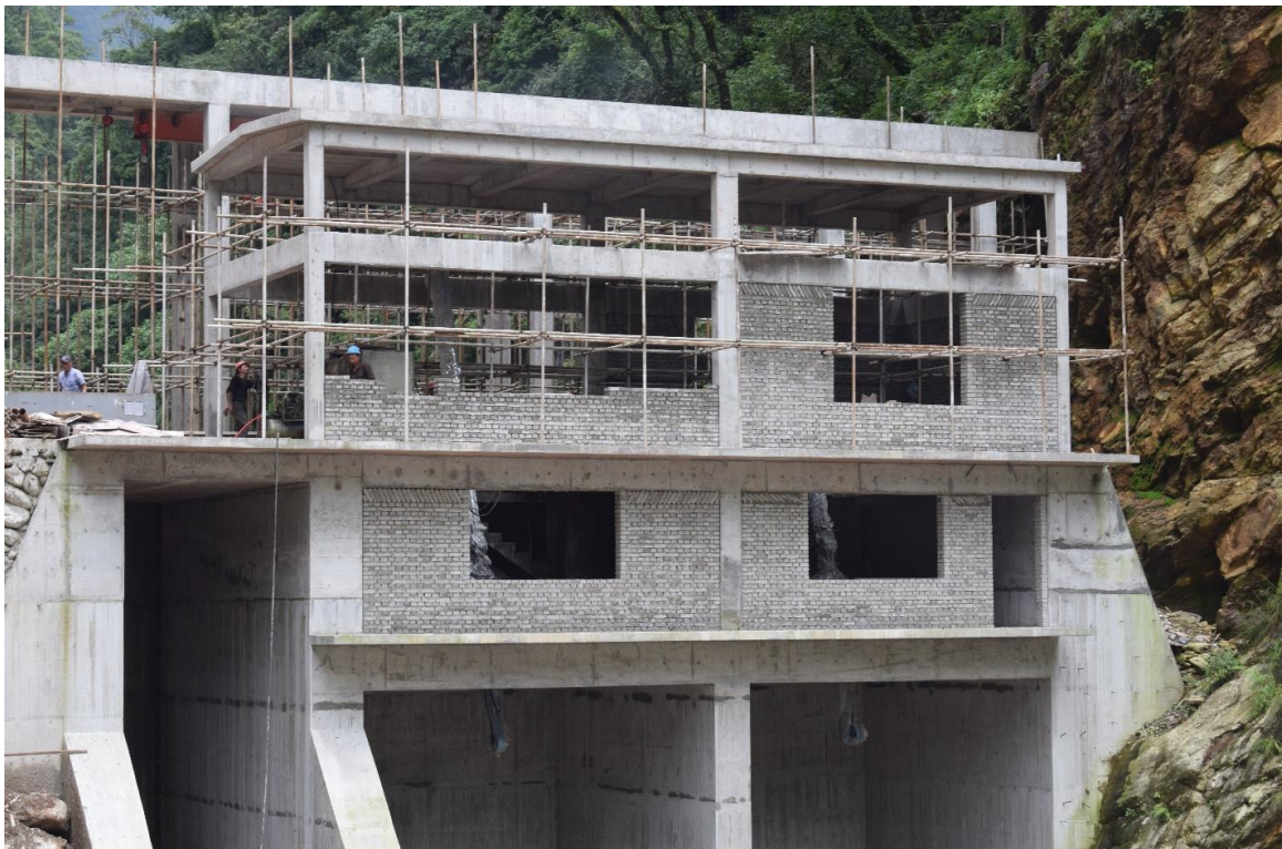
Figure 10: Brick Work at the Control Room and Hoist Room of the Headworks