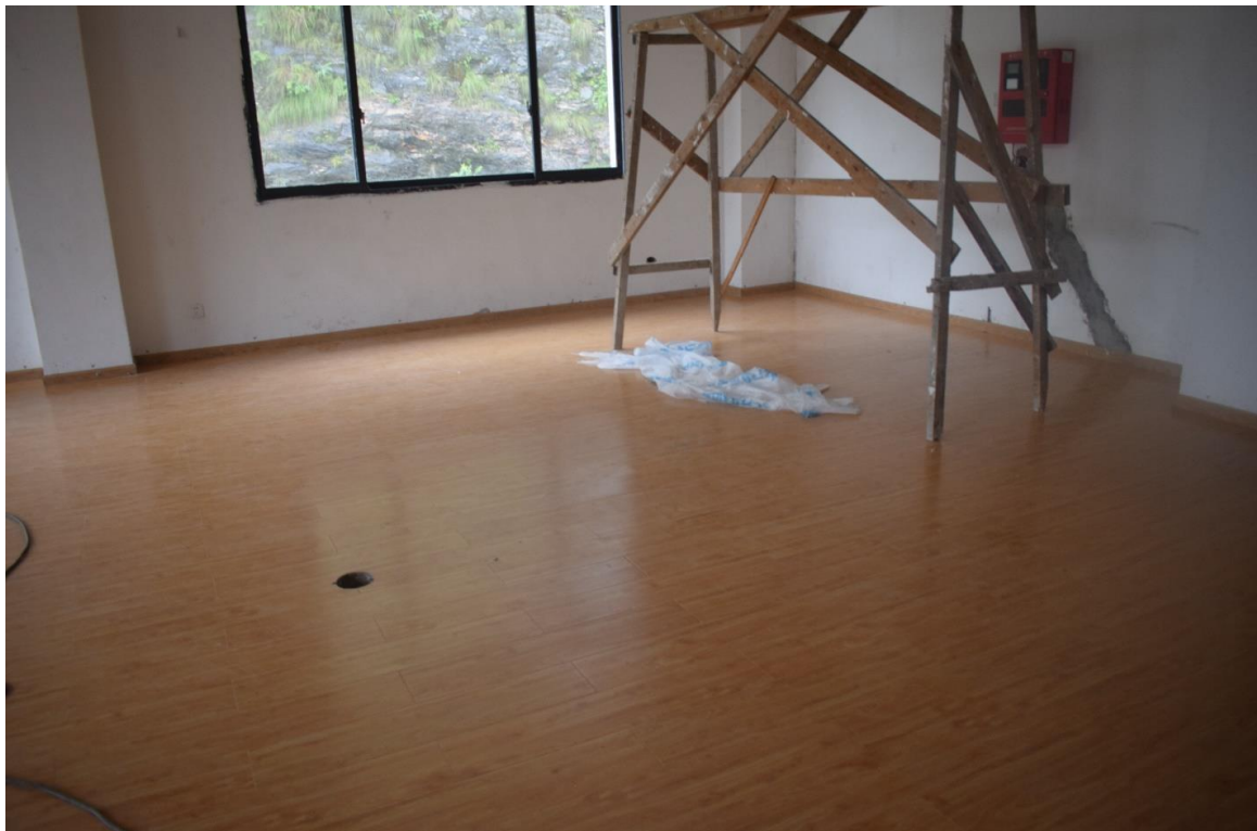
Figure 20: Parqueting Work at the Control Room of Powerhouse

been completed. Steel Doors and windows frames installation has been completed. Glass installation on windows has been completed. Railing installation at staircase and cut out portion has been completed. Drainage at the periphery of powerhouse building has been completed. Plaster work at floor of main unit, control room and auxiliary powerhouse has been completed. Laying of tiles on the floor of control room, main unit section has been started on the month June. Parqueting work and false ceiling work at the control room section of power house has been started from the month of July. Temporary camp dismantles and surface leveling at powerhouse area has been completed. Structural concrete of tailrace has been completed. River protection works has been completed in the powerhouse area. Retaining wall about 153m has been completed. Stone soling work at the slope of retaining wall of powerhouse about 153m has been completed.