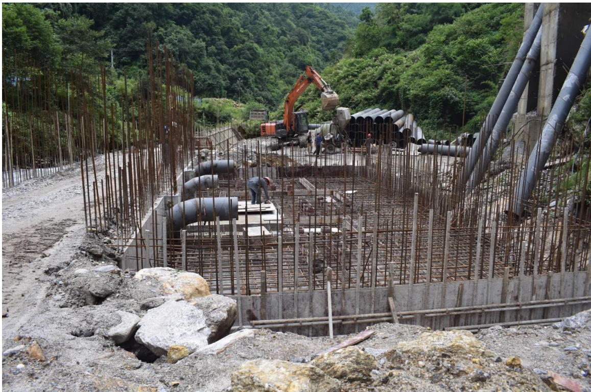
Figure 13: Reinforcement Work at the Base of Siuri Diversion Pump House up to 1367.50masl