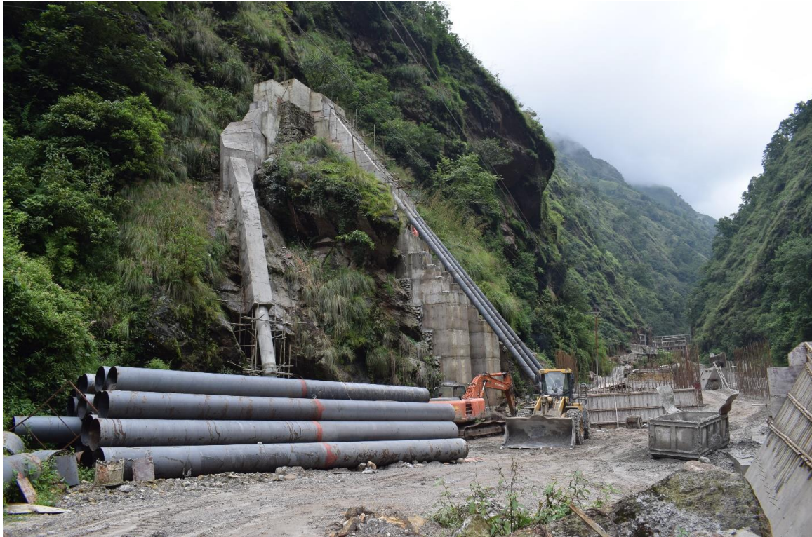
Figure 17: Outlet Pipe Casing of the Siuri Water Diversion System