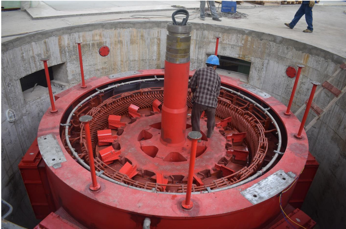
Figure 31: Rotor Installation at the Unit 1 of Powerhouse