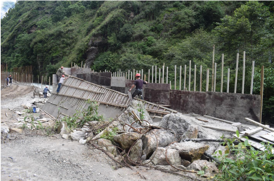
Figure 15: Formworks at the Retaining Wall of Siuri Diversion Pump House