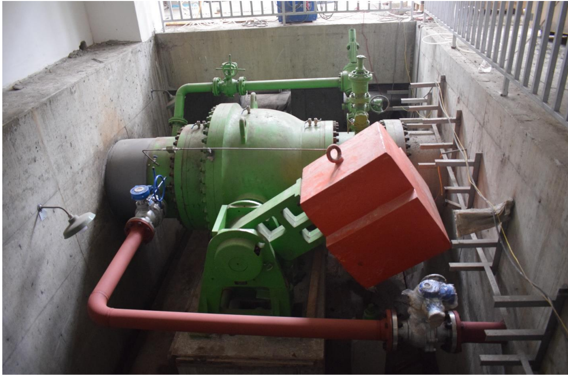
Figure 27: MIV Installation at Unit 2 of Powerhouse