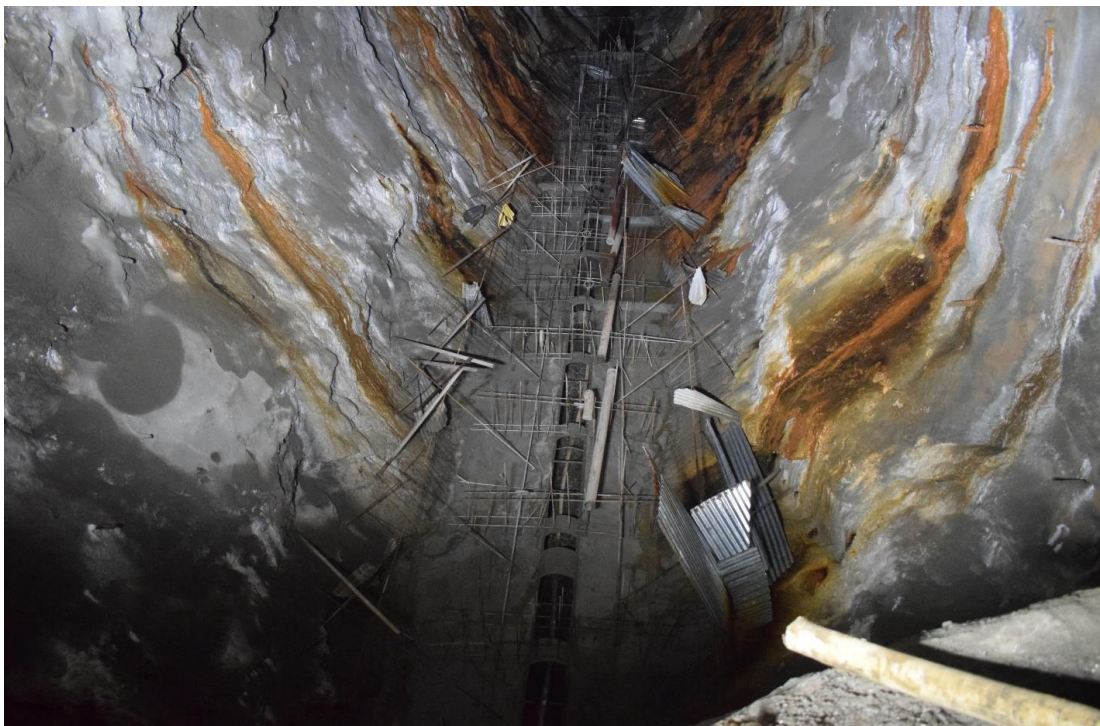
Figure 18: First Lift Concrete Work at the Invert of Settling Basin

Excavation of Underground Settling Basin has been completed and breakthrough from the Flushing tunnel to the Settling Basin was completed on 23 rd January, 2019. The length of settling basin is 62 m and its dimension is 8m x 8m x 62 m. Excavation has been completed as size of approach tunnel and widening to its full size is completed and shotcrete lining has been completed. Flushing pipe installation (60cm Dia) and first lift concrete work at the invert has been done for this month. Box culvert (size 1.5m*2.0m*27m) for the flushing tunnel at the outside of adit I has been completed.