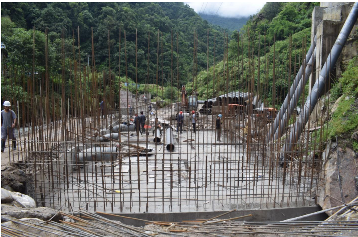
Figure 12: Concrete Work at the Base of Siuri Diversion Pump House up to 1365.75masl