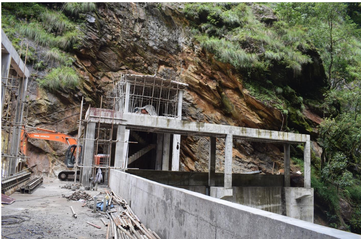
Figure 8: Concrete Work at the Hoist Slab of Intake Gate up to Level 1402.00masl