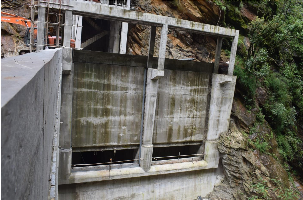
Figure 23: Bottom and Side Frame of the Trash Rack Installation at Intake