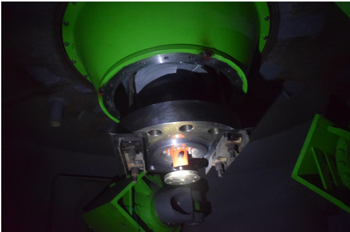
Figure 28: Main Shaft Installation at the Unit 1 of Powerhouse