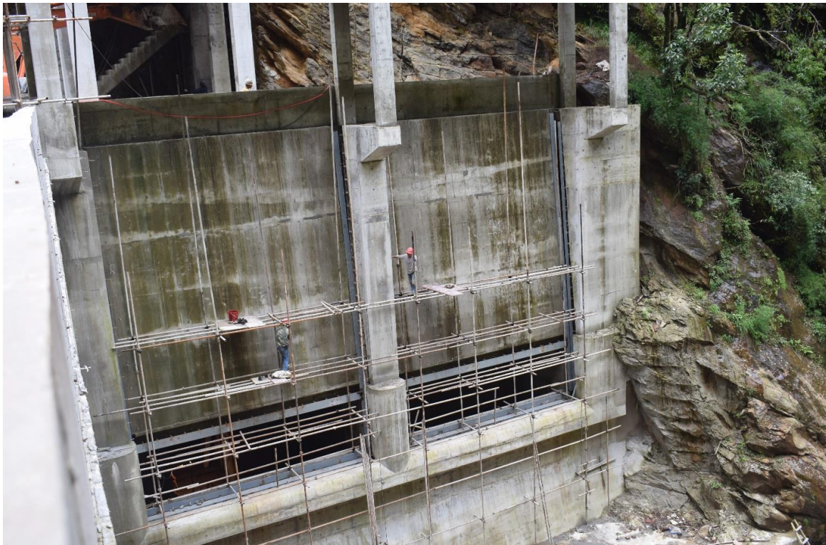
Figure 24: Bottom and Side Frame of the Trash Rack Installation at Intake