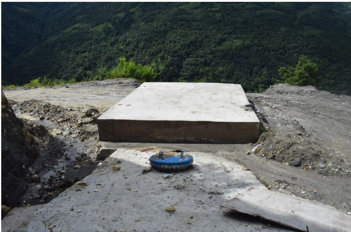
Figure 19: Concrete Work at the Anchor Block 4

The length of penstock alignment is 780 m. 13 nos. of saddle support (100%), 11 nos. of anchor blocks (100%) and concrete staircase has been constructed at back slope of powerhouse. Excavation of penstock alignment has been finished. About 620 m Concrete Casing of Penstock Pipe has been completed. About 100 m normal back filling as original ground slope has been completed. Anchor blocks nos. 1, 2, 3, 6, 7, 8, 9, 10 and 11 has been completed.