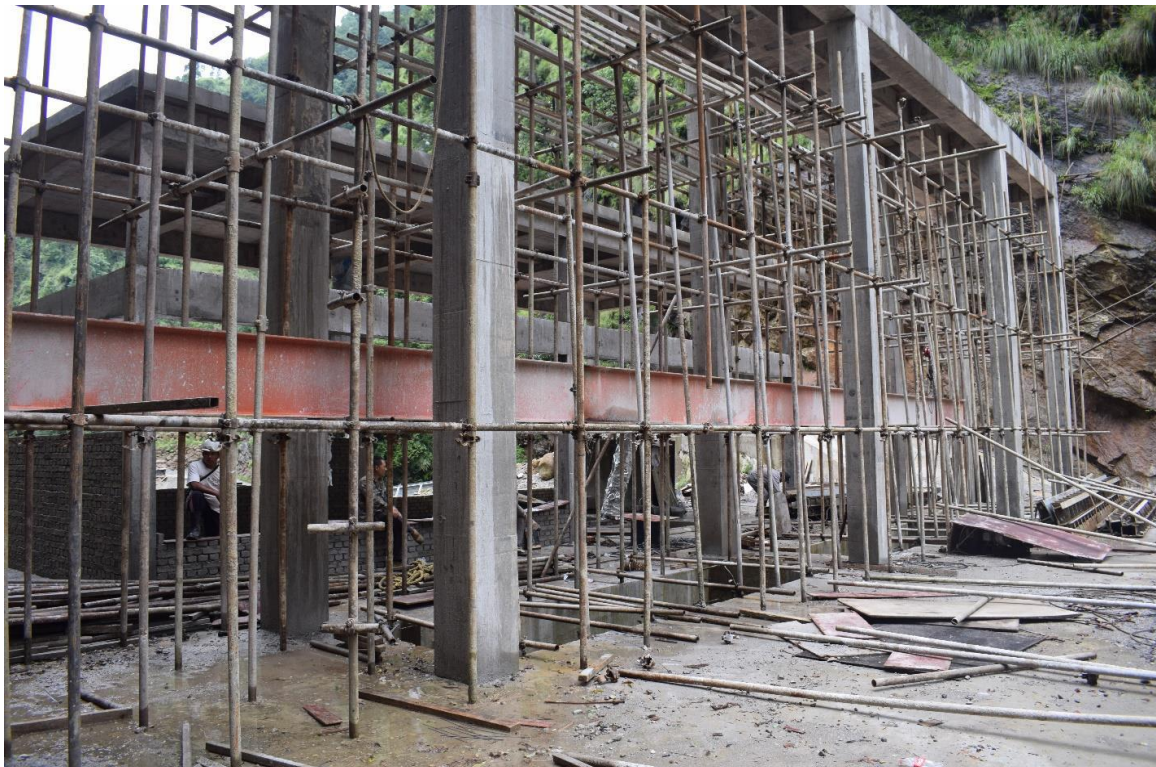
Figure 25: Lifting of the Monorail Beam for Fixing at the Hoist Slab