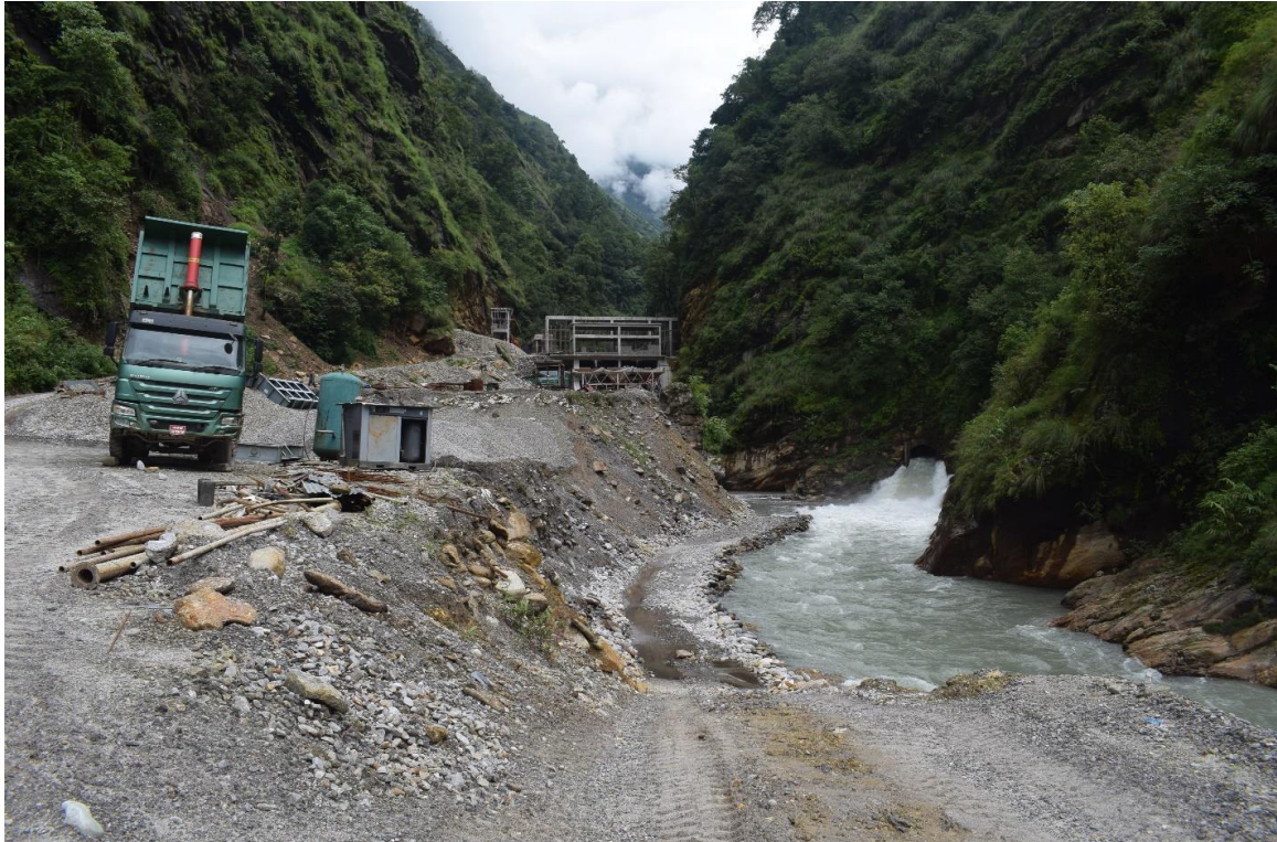
Figure 2: Outlet of the Diversion Tunnel

The 300 m long diversion tunnel excavation has been finished. Concreting at Inlet and outlet part has been completed.