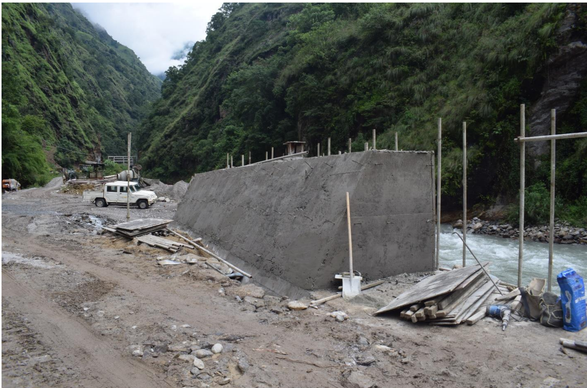
Figure 16: Concrete Work at the Retaining Wall of Siuri Diversion Pump House