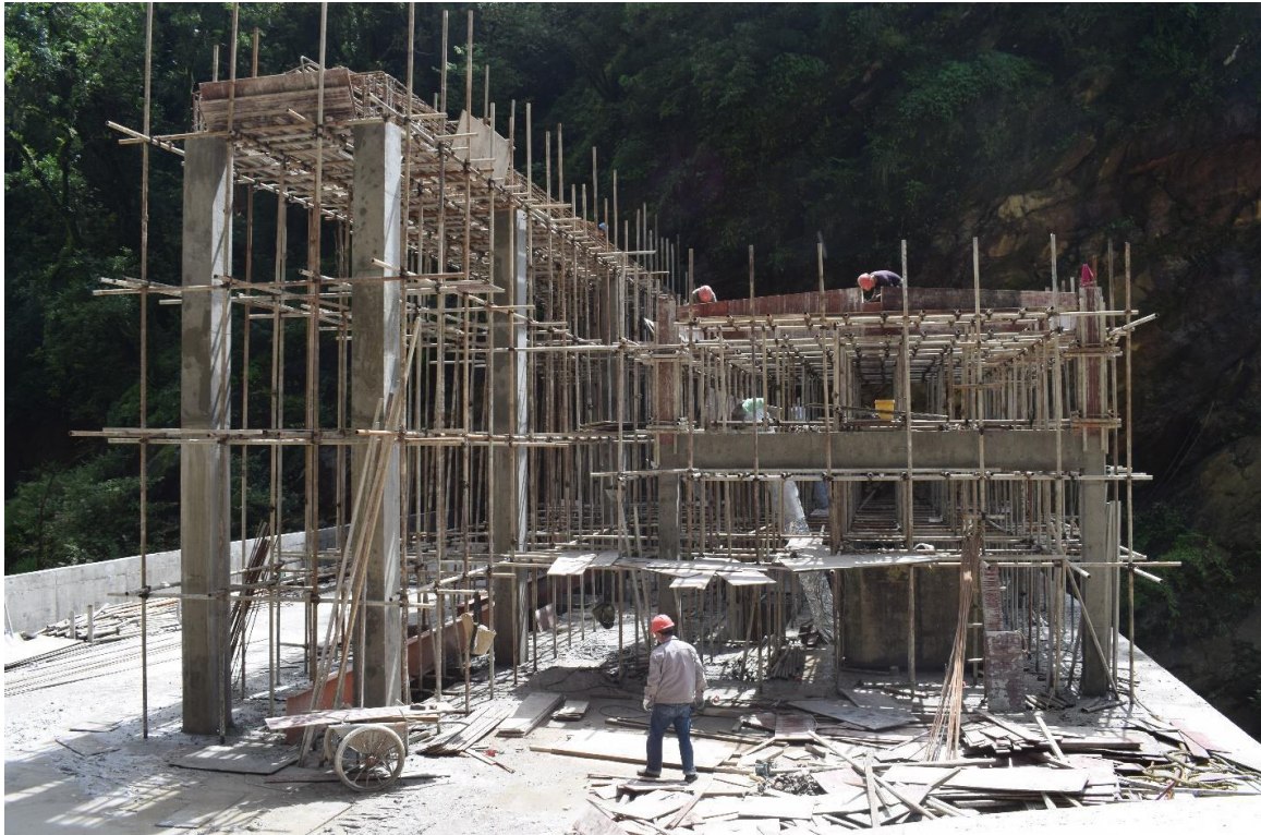
Figure 5: Reinforcement Work at the Hoist Slab of Stop Logs up to Level 1398.00masl and Hoist Room up to Level 1396.00masl