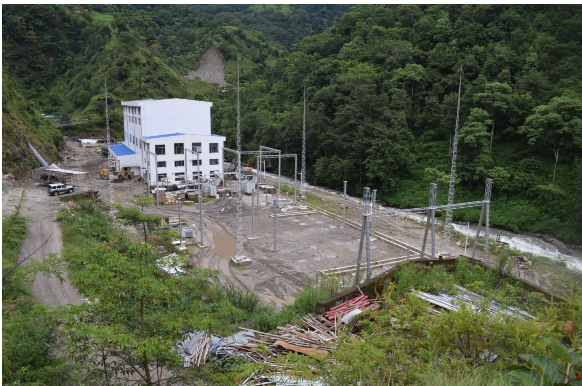
Figure 22: Outlook of the Powerhouse and Switchyard Area