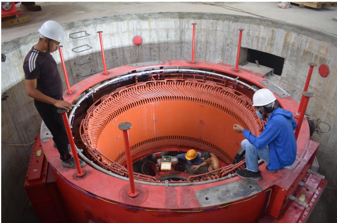
Figure 30: Final Positioning of the Main Shaft and Stator at Unit 1