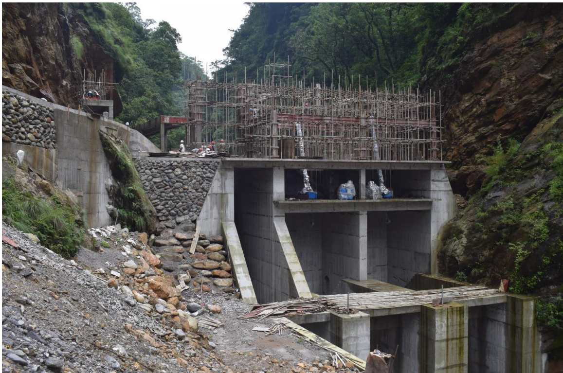
Figure 3: Reinforcement and Formworks at the Column of Hoist Slab and Hoist Room