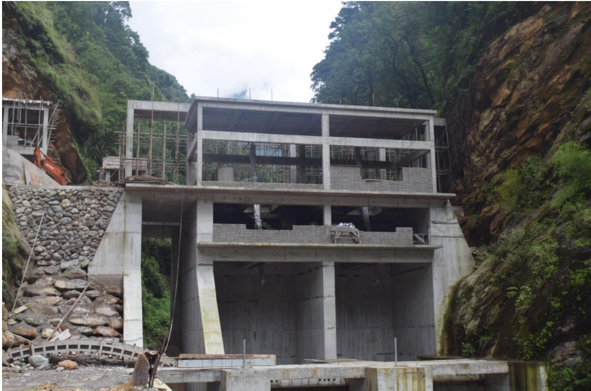
Figure 9: Brick Work at the Control Room and Hoist Room of the Headworks