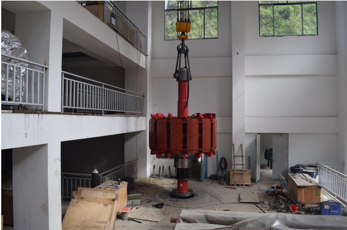
Figure 29: Assembled Rotor Lifting for Installation at Unit 1