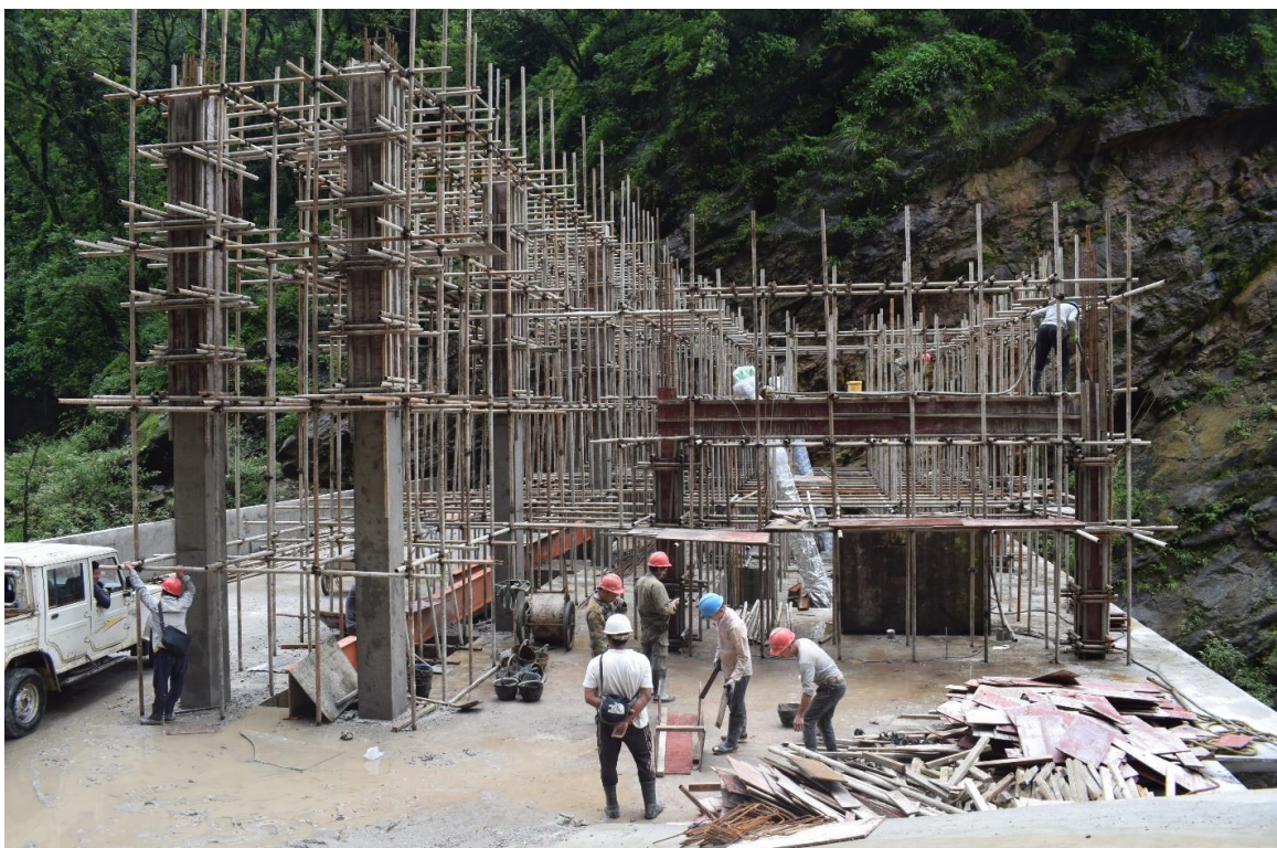
Figure 4: Reinforcement and Formworks at the Column of Hoist Slab and Hoist Room