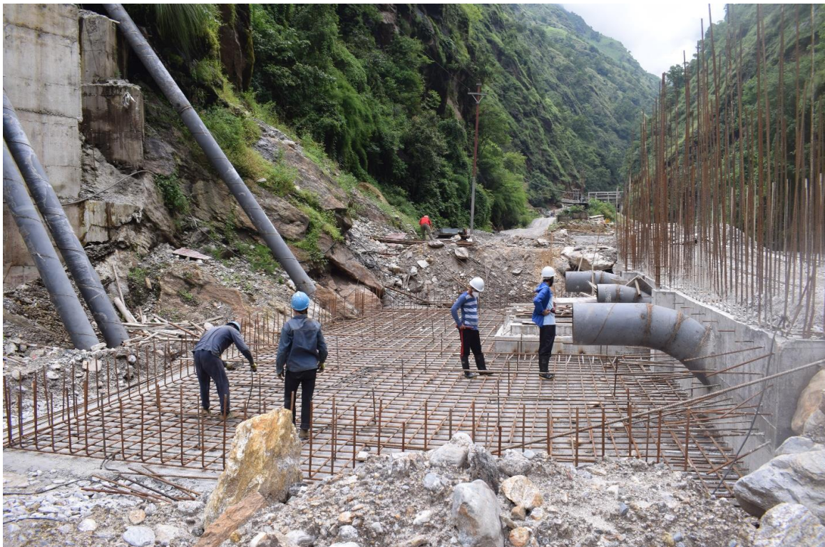
Figure 11: Reinforcement Work at the Base of Siuri Diversion Pump House up to 1365.75masl

retaining wall and water inlet pool of pump house up to level 1365.75masl has been completed for this month. Concrete work at the pump house up to the level 1367.50masl has been completed for this month. Outlet penstock pipe casing is ongoing.