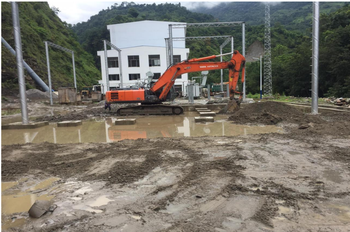
Figure 21: Backfilling and Leveling at the Switchyard Area