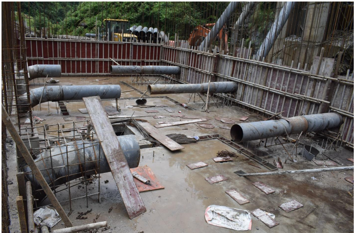
Figure 26: Penstock Pipe Installation Inside of the Pump House of Siuri Diversion System