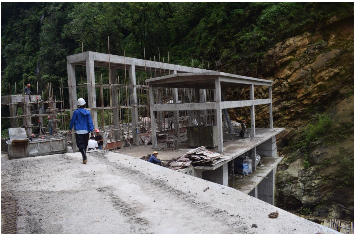
Figure 6: Concrete Work at the Hoist Slab of Stop Logs up to Level 1398.00masl and Hoist Room up to Level 1396.00masl