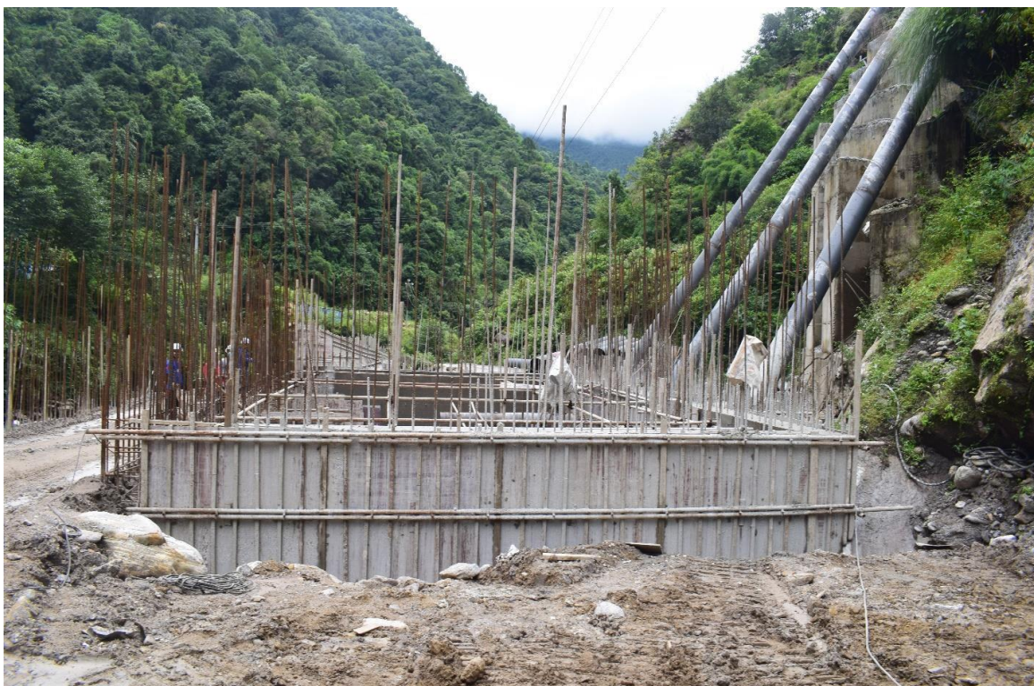
Figure 14: Concrete Work at the Base of Siuri Diversion Pump House up to 1365.50masl