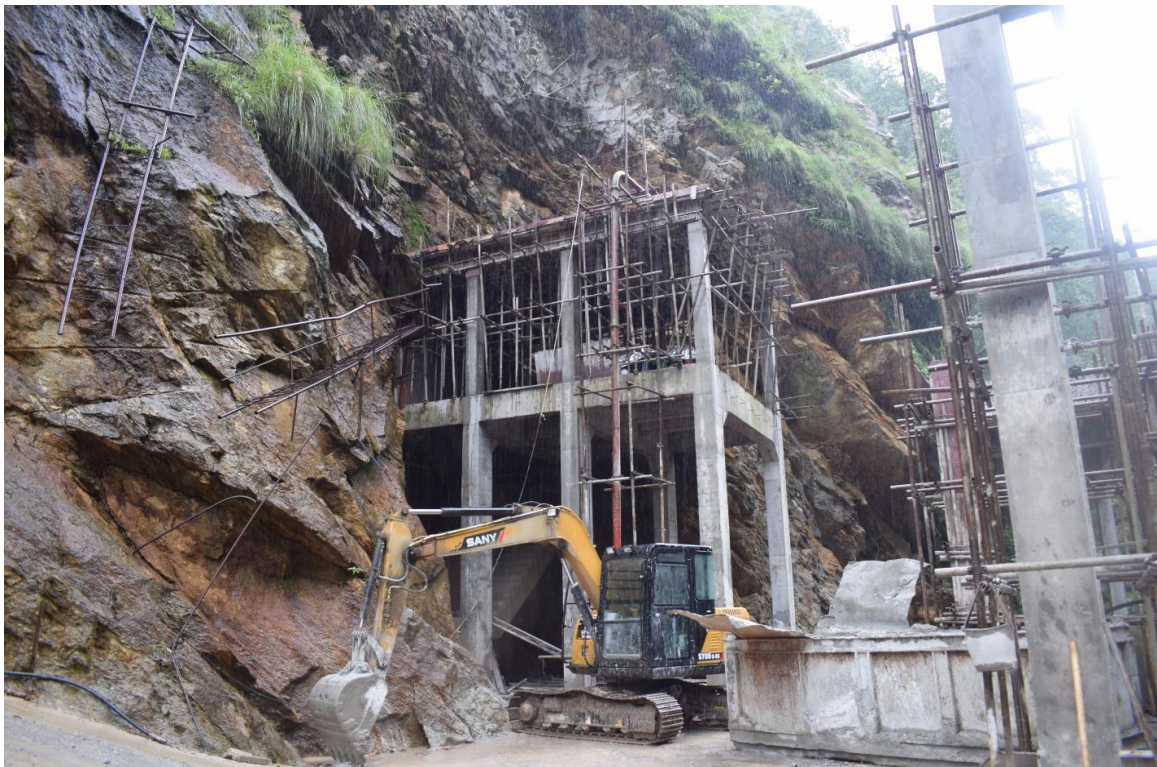
Figure 7: Reinforcement Work at the Hoist Slab of Intake Gate up to Level 1402.00masl